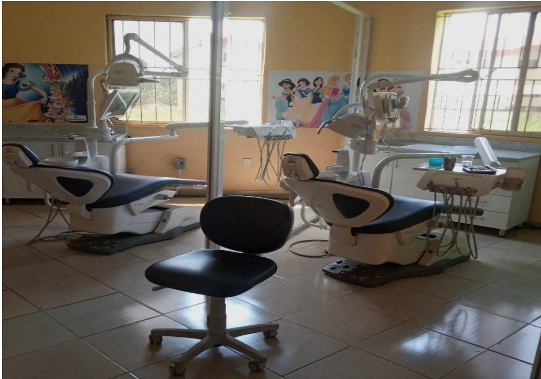
Fig. 78 Brazilian Medical Dental Chairs at OAUTH, Ile-Ife, Osun State