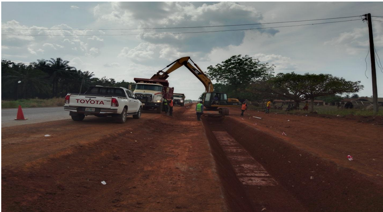
Fig. 8 Ongoing Construction of Drainage along the 22km length asphalted on Makurdi-Naka-Adoka road in Benue State