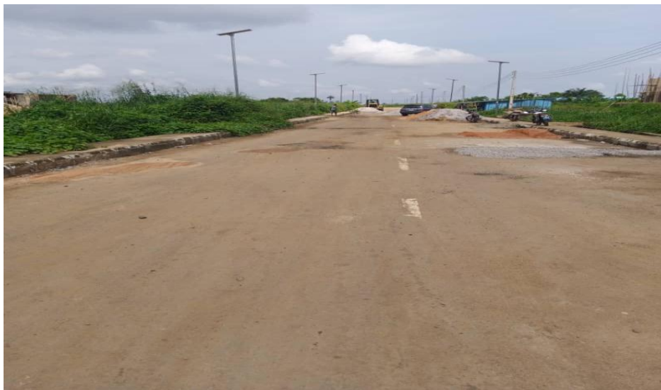
Fig. 61 view of the completed Internal Road 15 of Maritime Academy of Nigeria, Oron, Akwa-Ibom State

In 2019, the project was re-awarded to AYF Development Nigeria Limited at the revised contract sum of N164, 341,813.88.