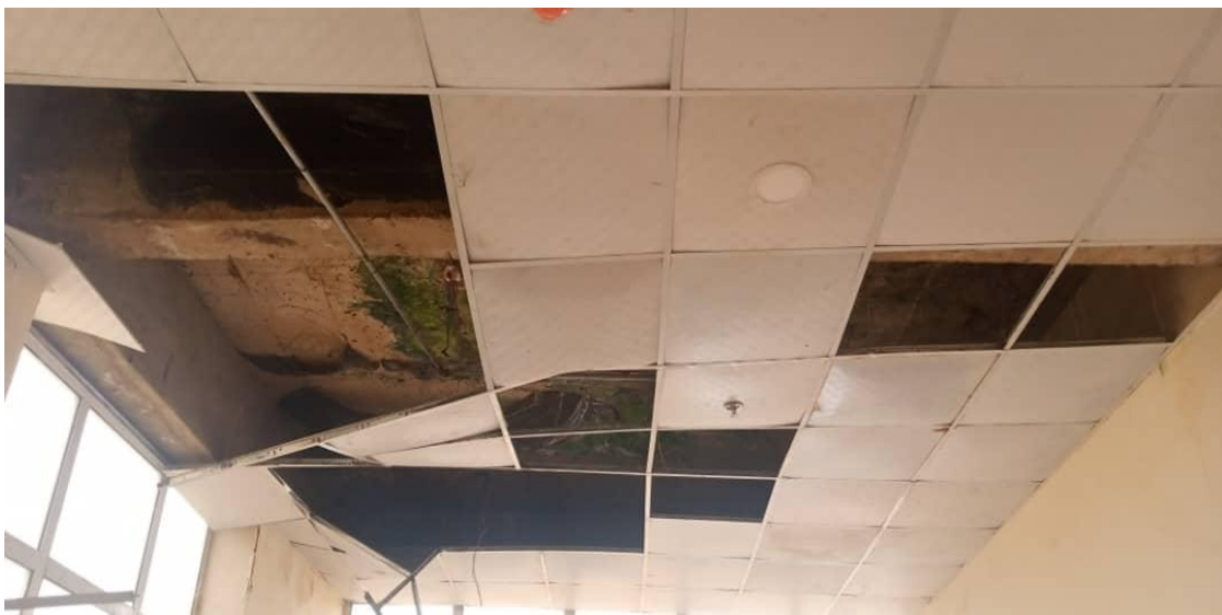
Fig. 42 A failed Section of the Ceiling in the NEMA's Building in Enugu State