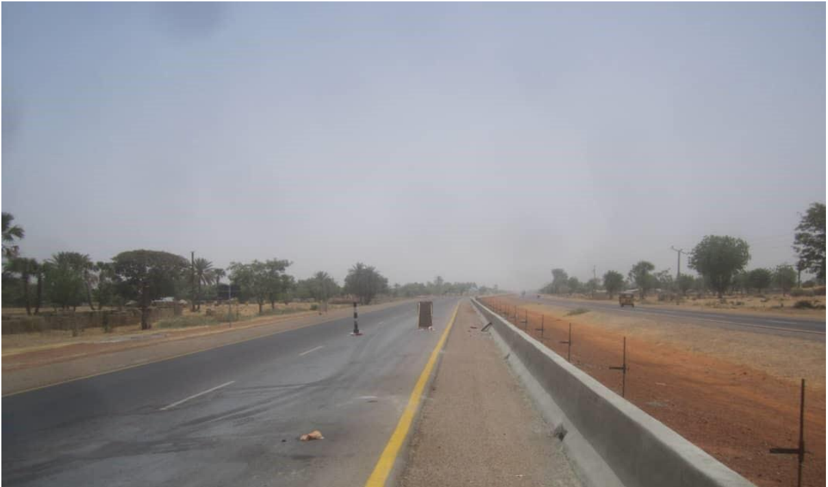
Fig. 16 Dualization of Kano-Maiduguri Road Section 1: Kano-Wudil-Shuarin

was extended up to 30th Dec, 2021. Outstanding payment of interim Certificate is ₦1,821,886,774.76.