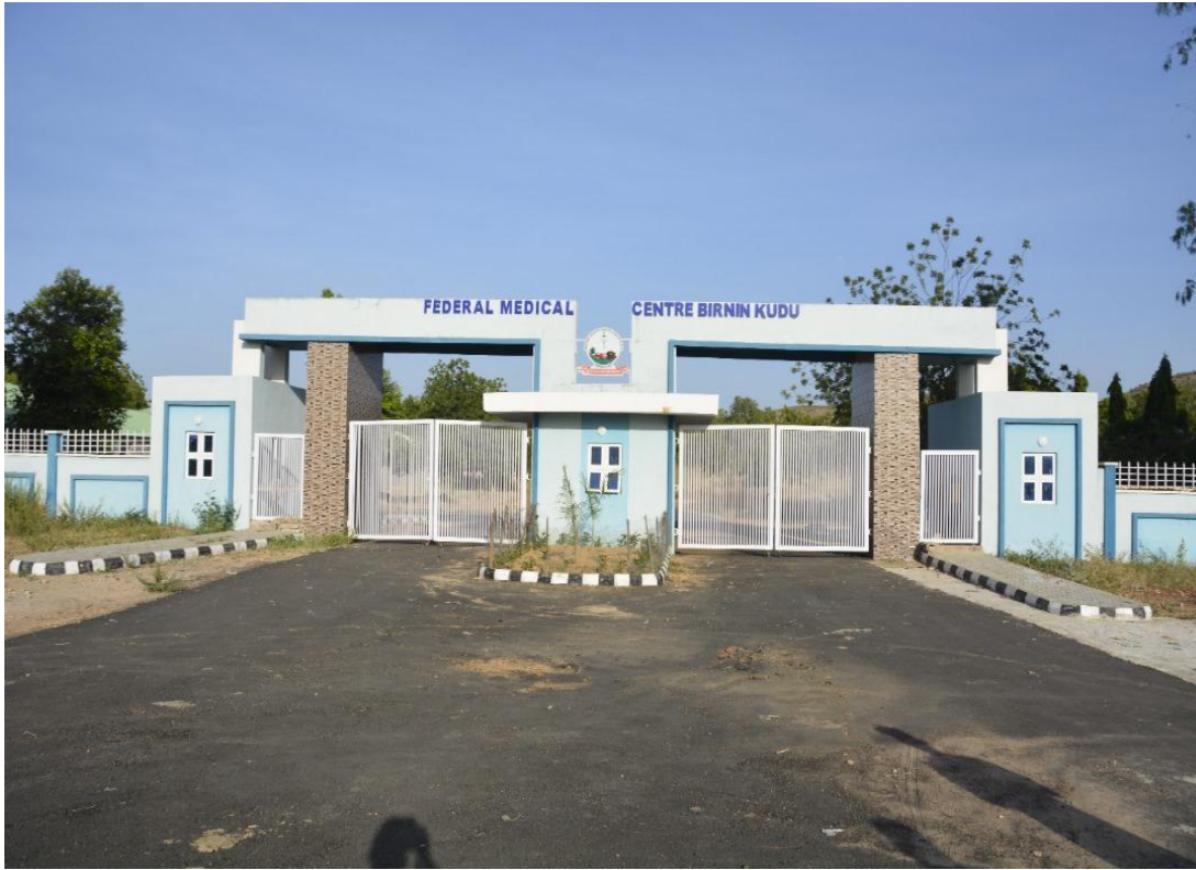
Fig. 30 Entrance and Exit gate at FMC, Birnin Kudu, Jigawa State

The contract was awarded to two contractors. The project for the construction of entrance and exit gate was awarded on the 2nd December, 2019 to SUB General Ventures Limited at the sum of N25,105,878.00 while the contract for the installation of street lights was awarded to MODANG INVESTMENT LTD at the sum of N49,892,098.72 for a duration of Twenty-four (24) months each. As at time of inspection, 93% completion has been achieved and project will be completed within budget.