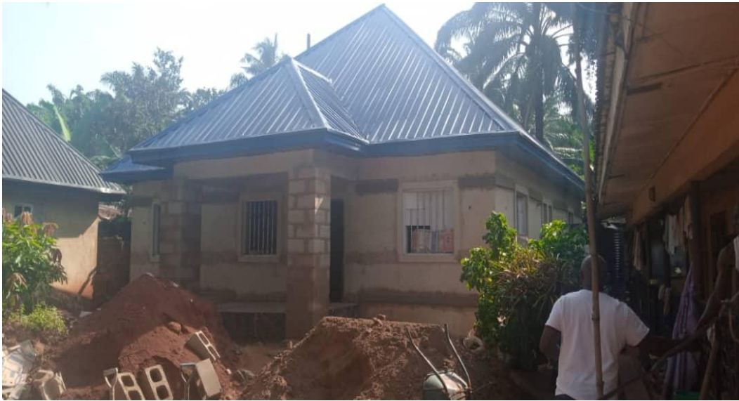
Fig. 48 Ongoing construction of 3-bedroom bungalow at Abagana in Njikoka LGA in Awka South Anambra South Senatorial District, Anambra State