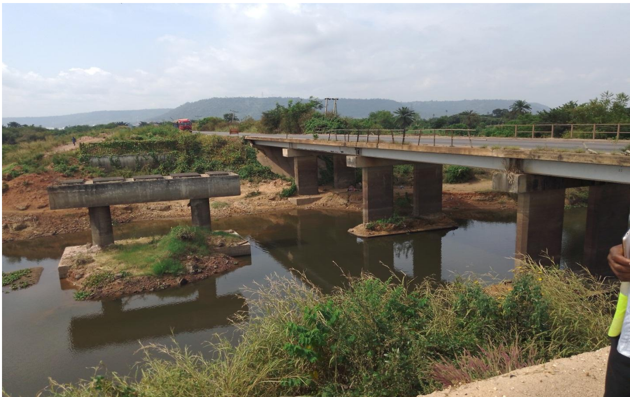
Fig. 1 One of the Completed Bridges at Section IV Koton karfe-Lokoja Road