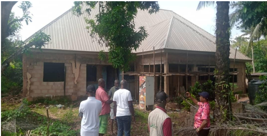
Fig. 49 Ongoing construction of 8-bedroom bungalow at Agulu in Anocha LGA in Awka South Anambra South Senatorial District, Anambra State