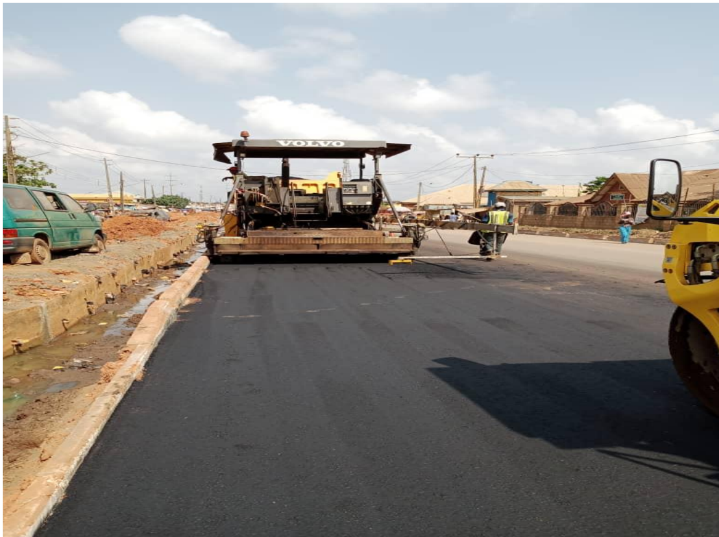
Fig. 66 Asphalted Section of Rehabilitation of Ikorodu - Shagamu Road in Lagos / Ogun States.