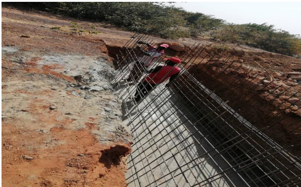
Fig. 40 The ongoing construction of Matan Fada road (Section 1) in Kunchi, Kano State

The road project is 12 km length single carriageway from the main road at Kunchi to Matan Fada town in Kunchi local government area. It was awarded to ARABS & Patners Limited on 14 th October, 2020 at the Contract sum of N200,000,000.00 with a completion date of 12 weeks.