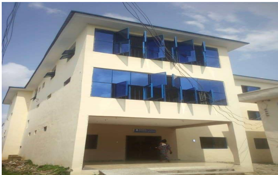
Fig.59 Front view of the already completed Medical Records/GOPD Block at FMC Yenagoa, Bayelsa State

The contract was awarded in December, 2010 to Samglo Construction Nigeria Limited at the sum of N223,848,619. The sum of N48,000,000 was released in 2018 while N142,271,326 was released in 2019 making a total of N190,271,326.