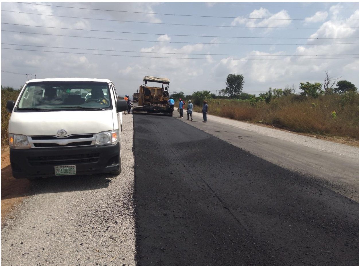
Fig.2 Section IV of Koton Karfe-Lokoja road being Alphated Construction