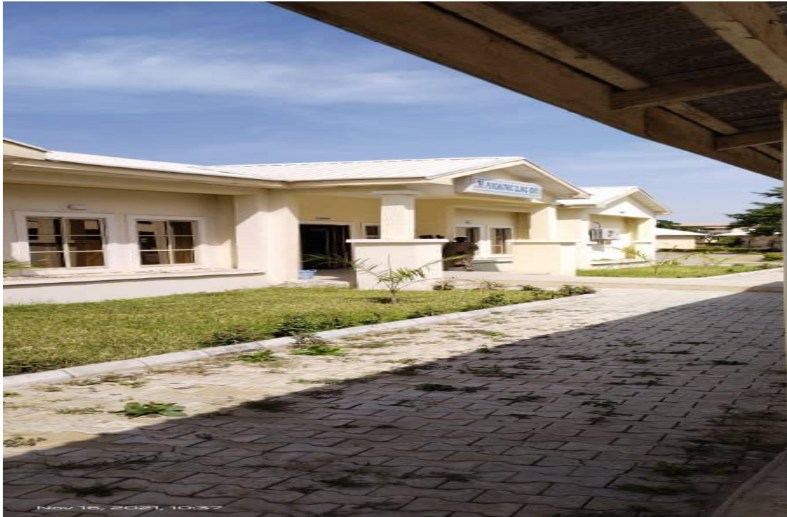
Fig. 20 View of Expanded Psychiatric Clinic (ATBUTH), Bauchi State

The Contract was awarded to Thames and Hudson Architect Ltd with Accurist Ltd as Consultant at the contract sum of ₦56,260,101.89 on 10 th December, 2019 for a period of 6 months. Total amount certified is ₦52,250,101.89 and the project is 100% completed.