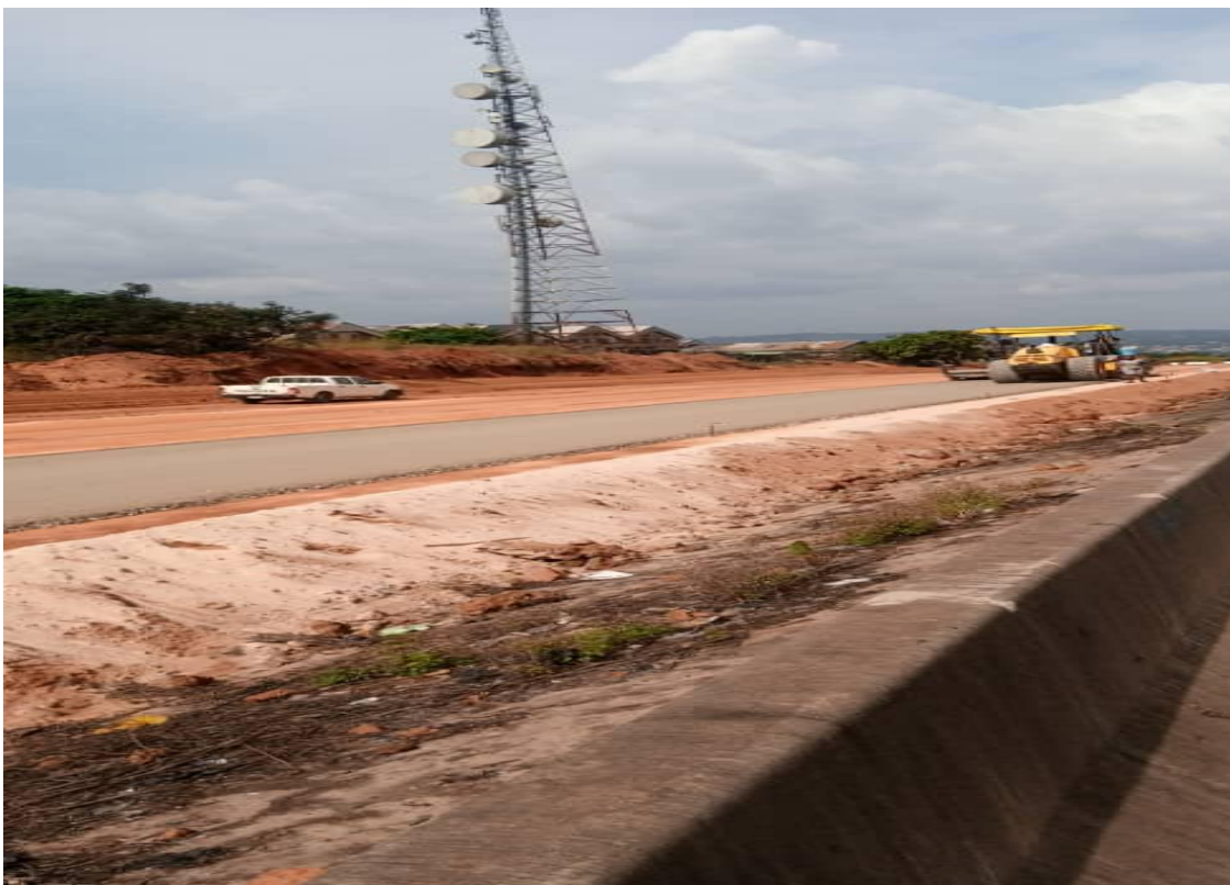
Fig. 44 Construction Work ongoing at the Enugu-Amansea Section of Enugu- Onitsha Expressway

Meanwhile, total original advance granted is N3,463,329,827.12 with advance payment augmentation of N5,402,480,556.99.