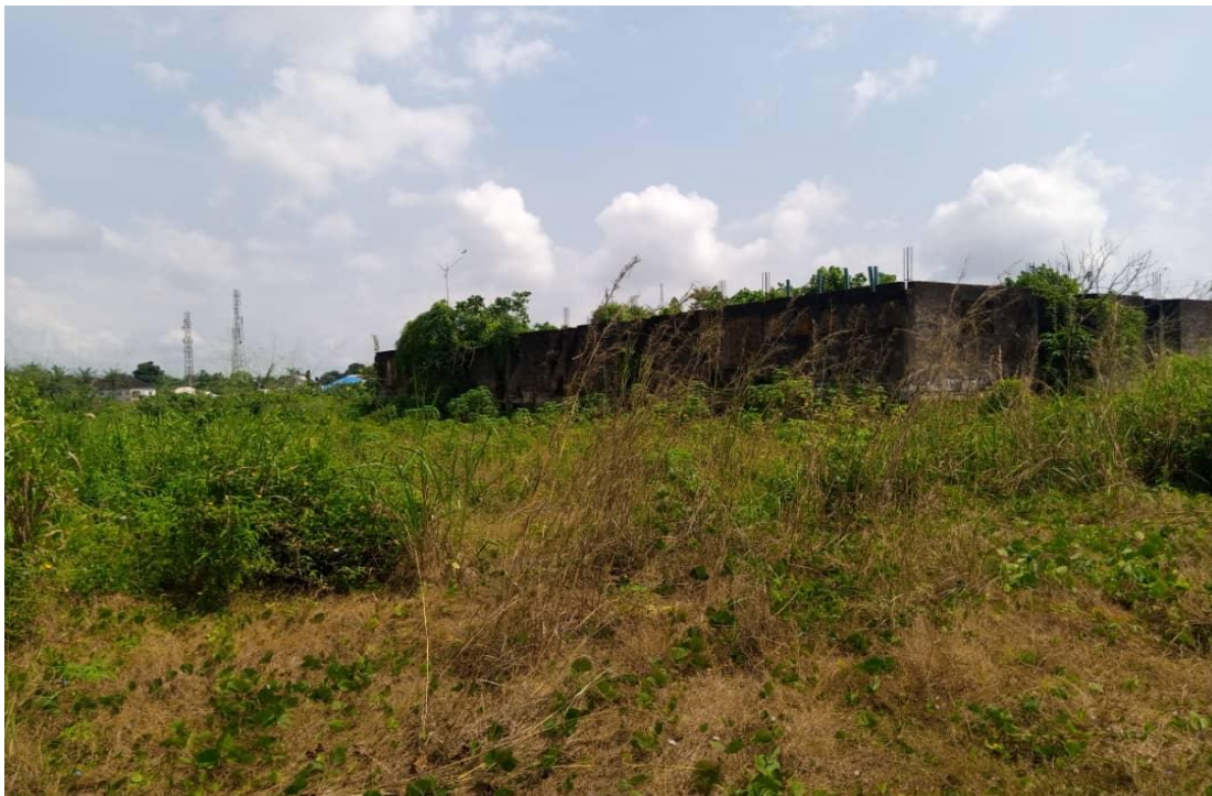
Fig. 63 Picture showing abandoned 100 Capacity Female Cadets Hostel of Maritime Academy of Nigeria, Oron, Akwa-Ibom State

The project was awarded in year 2011 to Messrs. Azi-Marine and Generation Nigeria Limited at the sum of N150, 000,000.00 for a 12month completion period. The Contractor abandoned site in 2013 and this led to the termination of the Contract by the Maritime Academy Management vide a letter dated 10 th October, 2021.