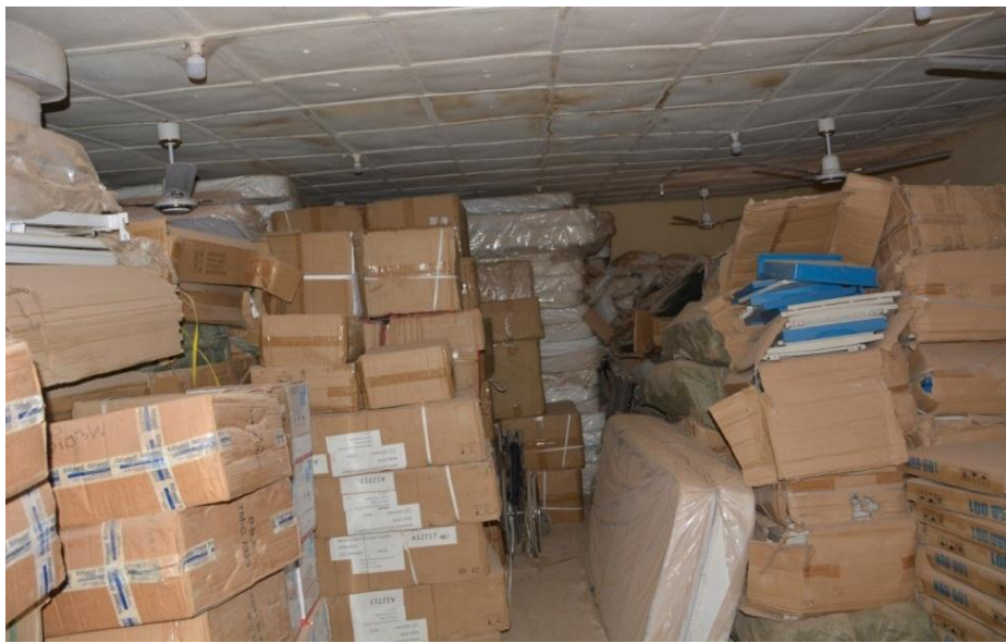
Fig. 39 Equipment Supplied to General Hospital, Kabo, Kano State

The scope of the project includes the supply of phototherapy machine, Industrial Washing Machine, Cardiac Beds, Peadiatric Cots, Bed Sheets, Blankets, Drip Stand, Pillow Case, Pillow, Sunction Machine, Office Table, Office Chair, B.p. Apparatus, Sunction Machine-Electrical, Sunction Machine-Manual, Glucometer, Pulse Oxymeter, Stethoscope, Cardiac Monitor, Sterilizer, Autoclaving Machine, Examination Couches, Apron, Trolley, Wheel Chair, Oxygen Cylinder (Giant Size), Oxygen Cylinder (Small Size), Spectrometer, Stop Watch, Mixer Machine, Full Blood Count Machine. Diathemy Machine, Operating Set for General Surgery, Operating Set for C/S Surgery, Beds, Baby Resuscitator, Bedside Lockers and Operation Lamp.