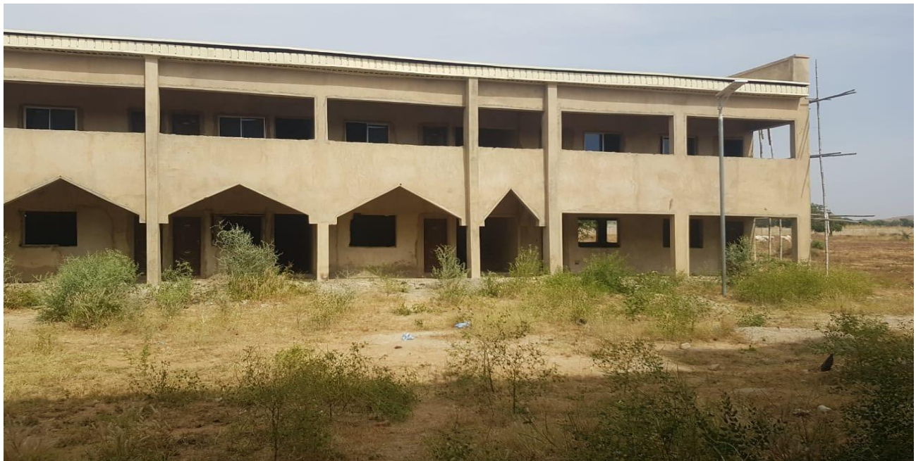
Fig. 36 Front view of the ongoing Construction of block of 8 Classrooms with offices at permanent site of Federal College of Agricultural Produce Technology, Kano.

The Contract was awarded to Abidine Nigeria Limited on 23 rd November, 2019 at the initial contract sum of N86,907,677.80 with a duration of forty weeks.