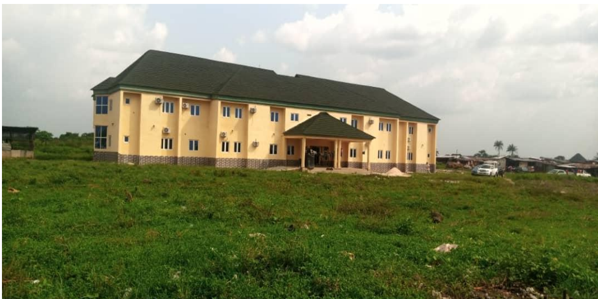
Fig. 50 Ongoing construction of NCS SHQ office at Owerri, Imo

So far, amount appropriated on the project is N124,987,593.81, while amount released and utilized is N67,350,599.24 which is indicated in report availed FRC as the only payment made, as the contractor was not on site to clarify if more payments have been received on the project.