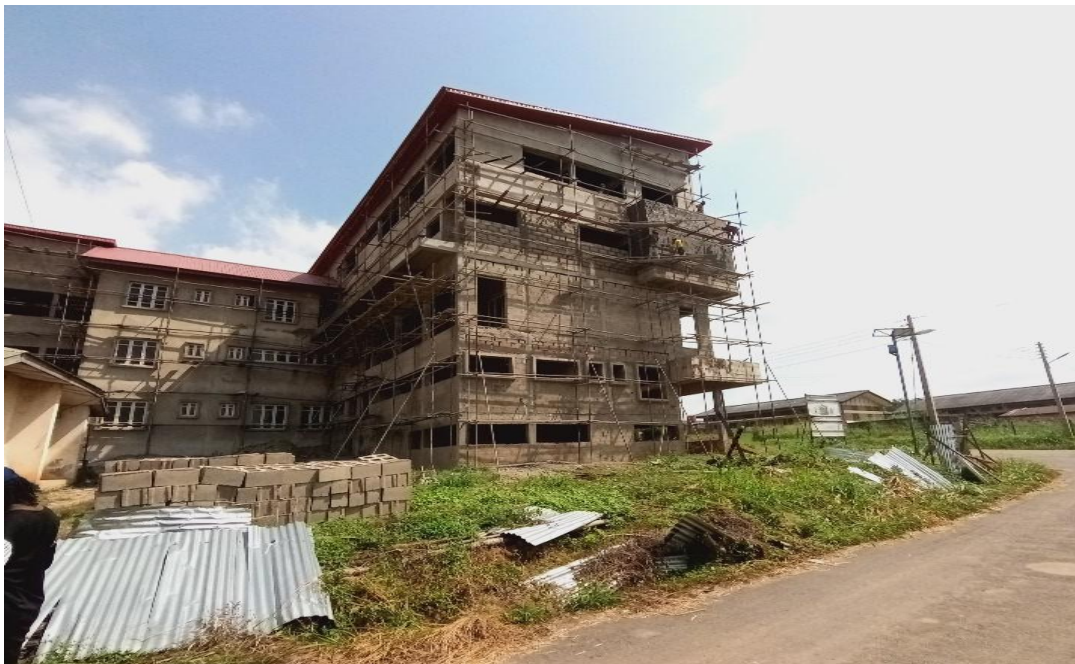
Fig. 76 On-going Construction and Completion of Theatre Complex at WGH Ilesha, Osun State