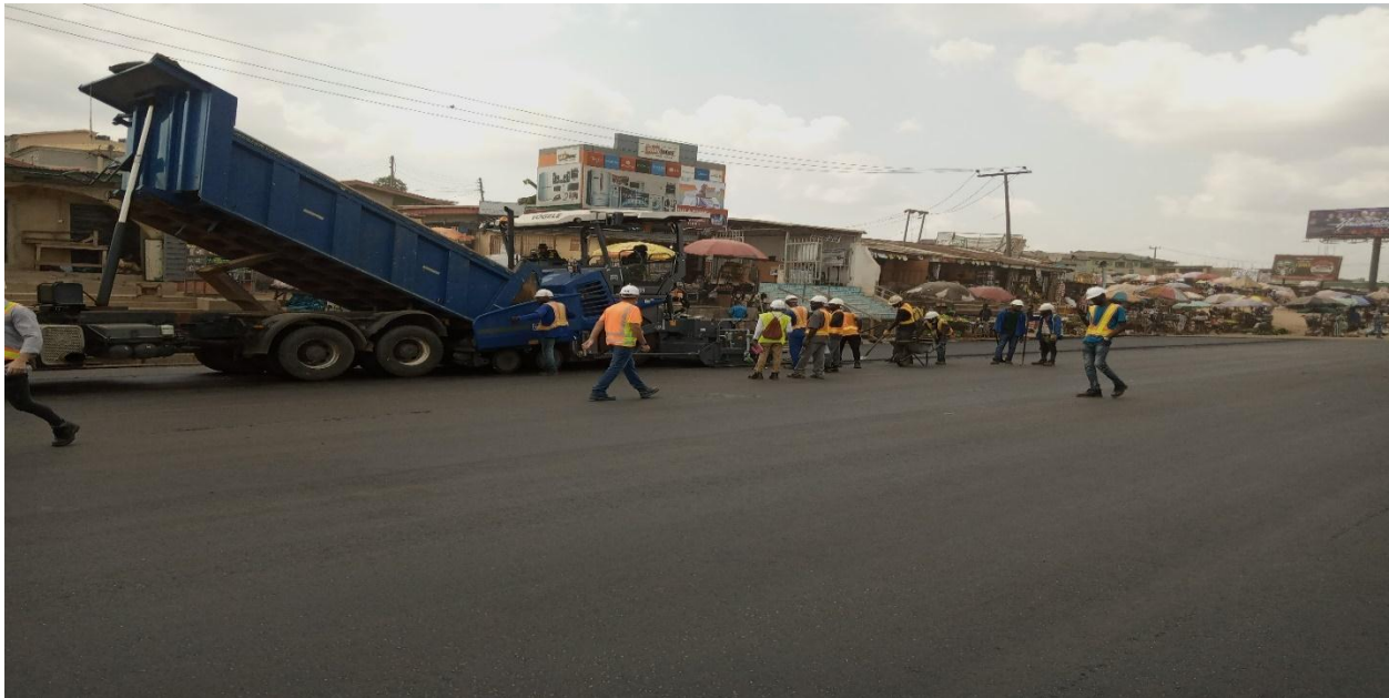
Fig. 67 Asphalted Part of Section II of the Rehabilitation of Lagos – Otta – Abeokuta Road in Lagos / Ogun States

The scope of works involves, but is not limited to the following: Site clearance and earthworks, scarification of existing bad carriageway and shoulders, milling of existing carriageway, provision and laying of 200mm approved laterite as sub base, provision and laying of 200mm approved crushed stone base, provision and laying of prime coat using approved bituminous emulsion, provision and laying of 60mm asphaltic concrete binder course on carriageway, provision and laying of tack coat, provision and laying of 40mm asphaltic wearing course on carriageway, provision and laying of 75mm crushed rock on shoulder and laying of 150mm sub base laterite in shoulder, prime coat on shoulder, provision and laying of 18mm single size aggregate on surface dressed shoulder, desilting and removal of debris on drain, catch pit, culverts and carriageway