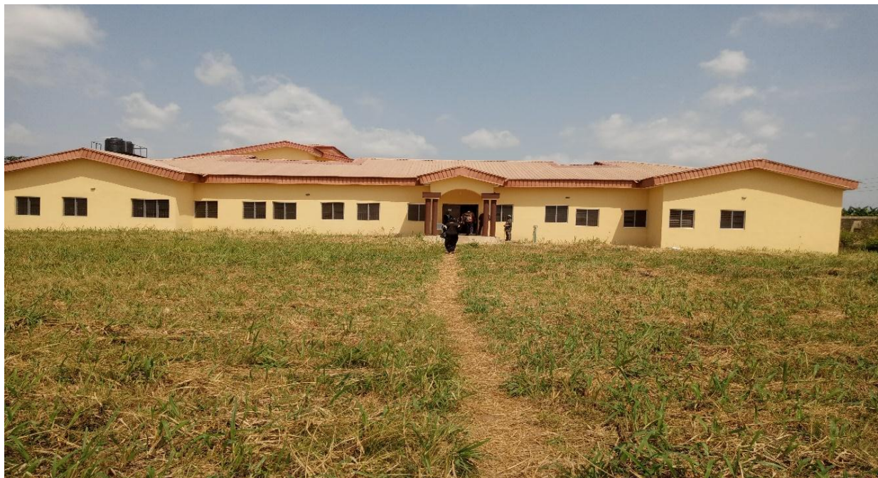
Fig. 79 Front View of Completed Cardiac Centre at OAUTH, Ile-Ife Osun State