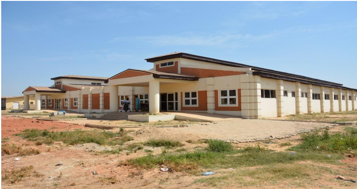
Fig. 38 Side view of the completed General Hospital at Kabo, Kano State