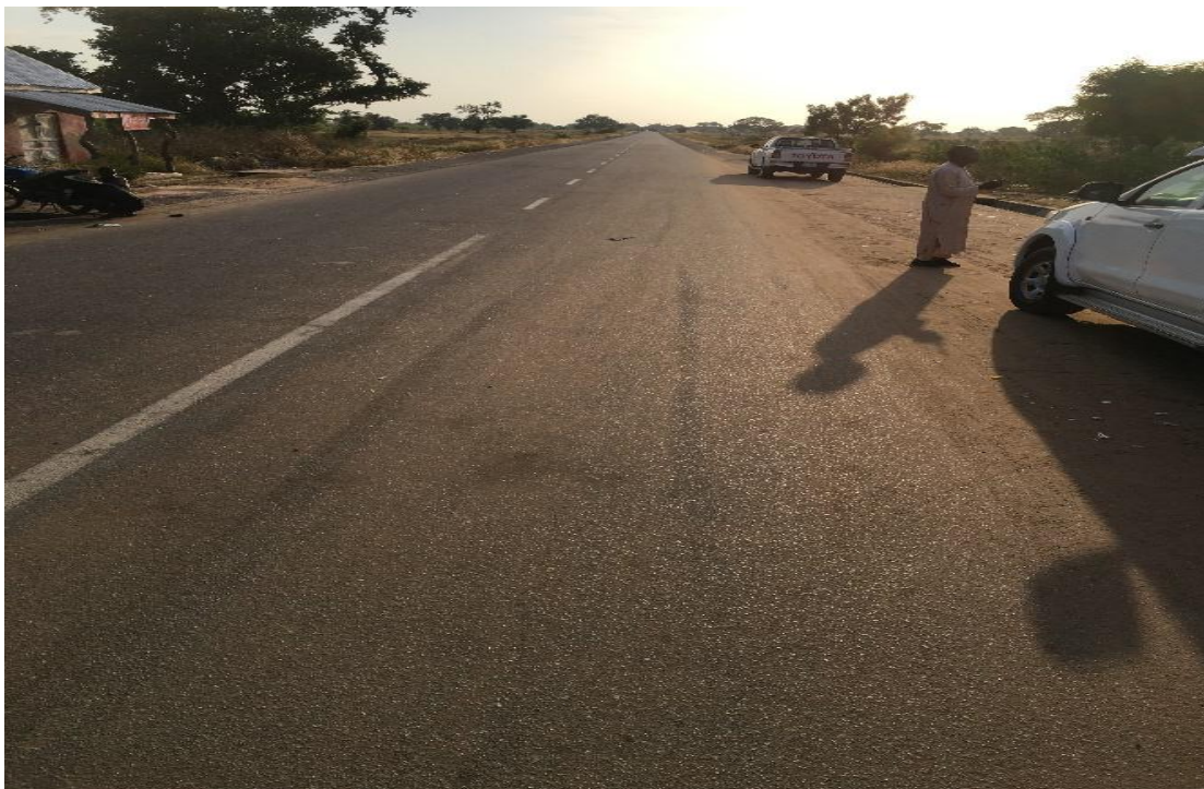
Fig. 13 Starting point of the Tumu-Pindiga kashere (Gombe State)-Futuk Yola (Bauchi State) road

This is a Federal Government project which involves the rehabilitation of Tumu-Pindiga kashere (Gombe State) Futuk- Yola (Bauchi State)- Bashar- Dengi (Plateau State) Road. C/No.6214.