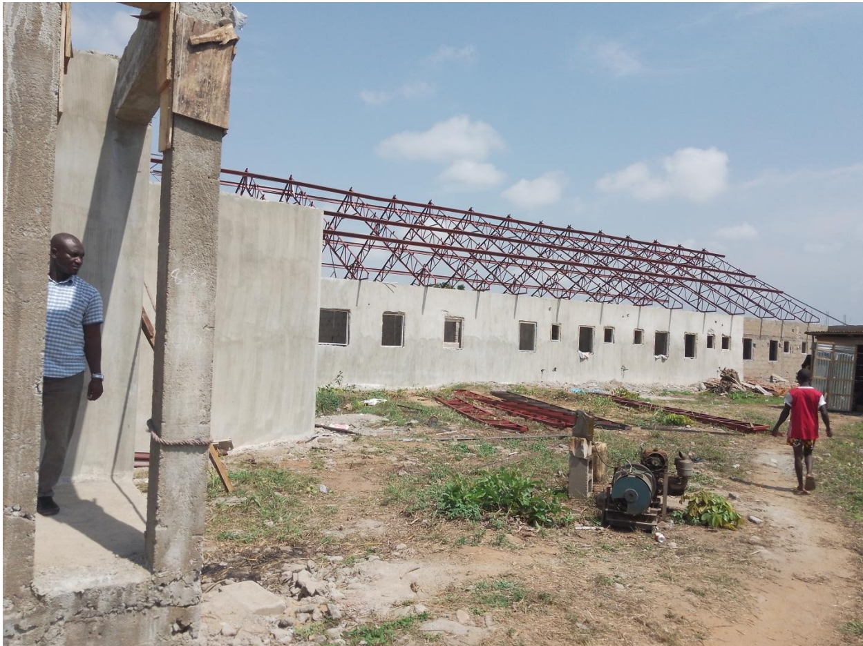
Fig. 11 Isolation Ward under construction at Federal Medical Centre Makurdi

The contract for the Construction and Furnishing of Isolation Ward was awarded to Kingsworth Integrated Services Ltd at a contract sum of N147,012,605.30 with a commencement date of July 6, 2020, and a completion date of December 31, 2021. The Contract is intended to contain the spread of infectious diseases like COVID-19, EBOLA, LASSA Fever, etc. It was at 60% completion at the time of inspection.