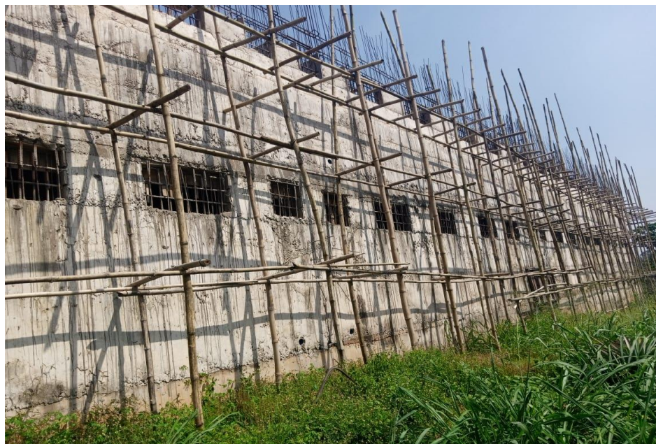
Fig. 56 Side view of the on-going construction of One Storey maximum Concrete Cell Block at Ogwashiuku Custodial Centre, Delta State