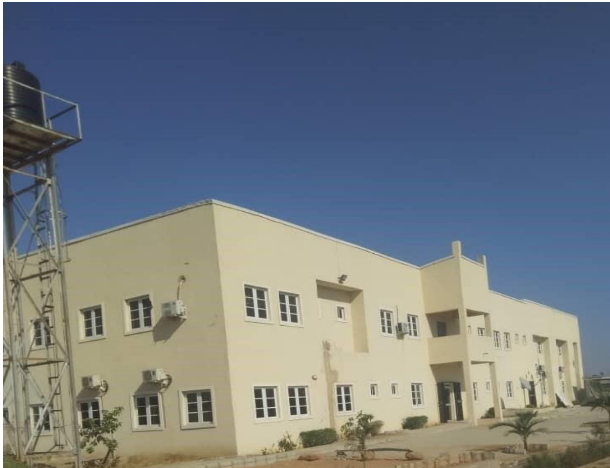
Fig. 21 View of the Expanded Psychiatric Clinic (ATBUTH), Bauchi State