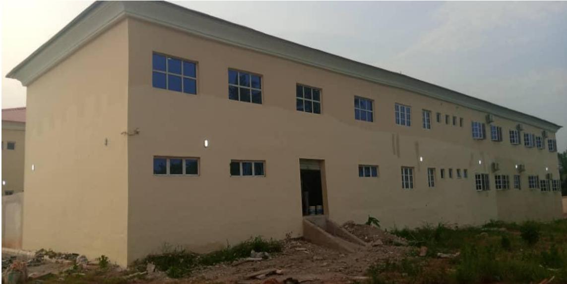
Fig. 53 The Technical Wing of ITF Area Office at Abakaliki, Ebonyi State