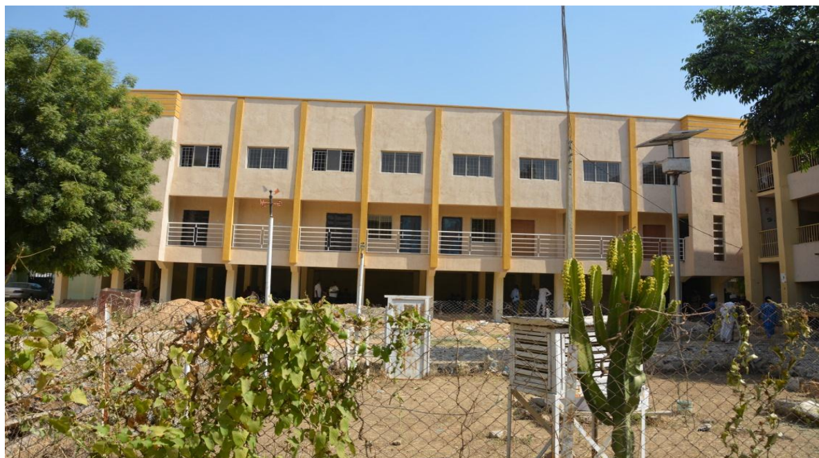
Fig. 35 The completed construction of classroom and officers at College of Agricultural produce and stored technology, Kano