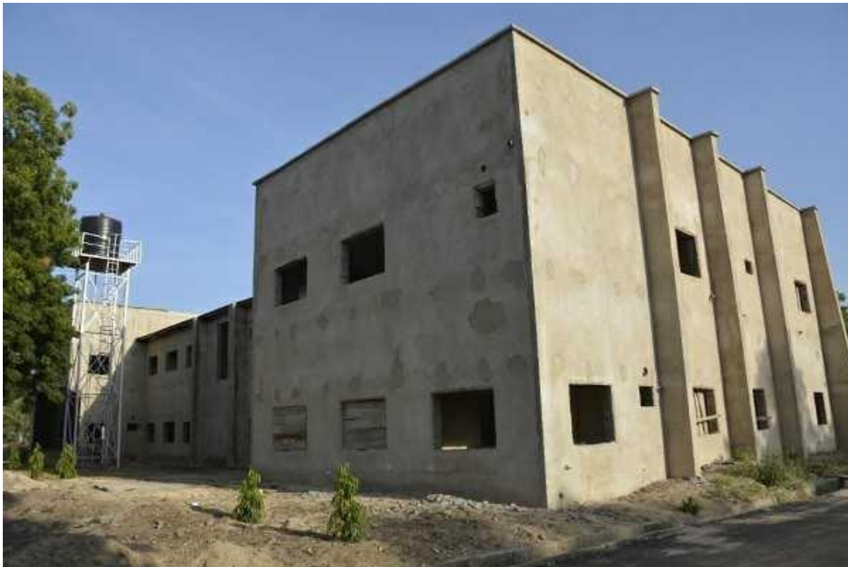
Fig.28 Ongoing construction of 2nos. Lecture Theatres for School of Post Basic Mid-Wifery at FMC, Birnin Kudu, Jigawa State.

The contract was awarded on the 21st December, 2018 to MOJAZ Construction Limited at the sum of N176,322,382.95 for a duration of Thirty-Six (36) months. As at the time of inspection, 50% completion had been achieved. Amount released and utilized from inception to date of inspection (16 th November, 2021) was N88,859,021.64.