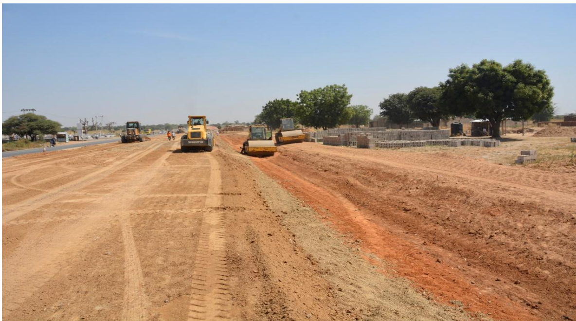
Fig. 36 The ongoing Rehabilitation and Construction of Kano-Gwarzo-Dayi Road