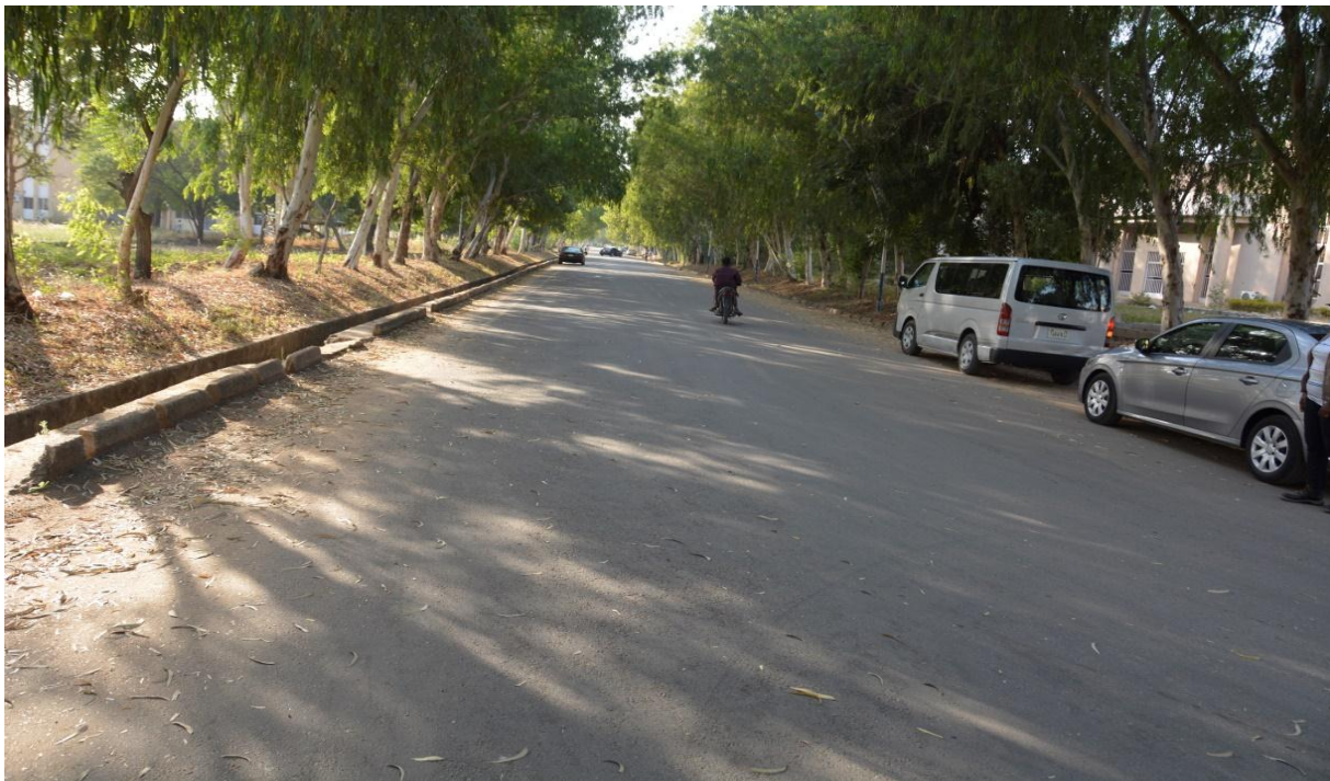
Fig.33 The completed section of Road Networks within the Premises of AKTH phase I, Kano