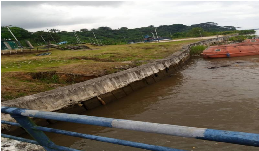
Fig. 62 Showing concrete outlay at Boatyard of Maritime Academy of Nigeria, Oron, Akwa-Ibom State

The Contract was awarded to Messrs. Freenet Global Services Limited in year, 2011 at the sum of N219, 995,205.41 for duration of 12months. It was explained to the Team that the Contractor abandoned site for three (3) years in 2015 and the Management made efforts that culminated in the Contractor resuming the project execution in year 2018.