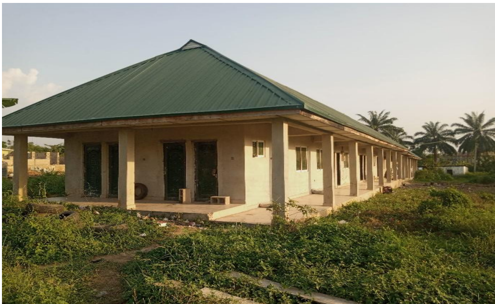
Fig. 68 Construction of Six (6) Classrooms at FCA, Ibadan, Oyo State.