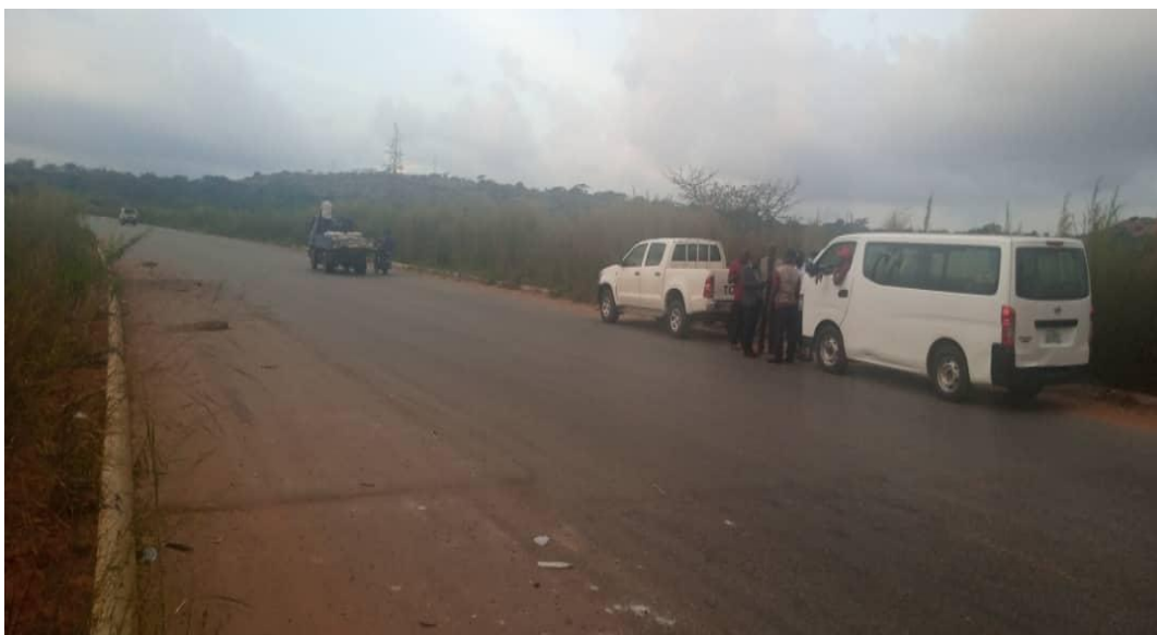
Fig. 43 The Cross-Section of 9 th Mile - Orokam Road in Enugu State under construction

Total amount certified and paid is N7,480,400,819 and N1,918,783,128 with N5,561,617,691 outstanding. Total Advance granted is N5,433,505,630.54 and work done up to date is km 3+800 – 6+025 (up to wearing level) and Km 6+025 – 7+250 (up to 2 nd binder level).