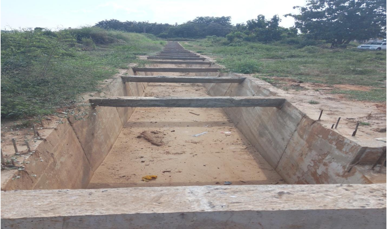
Fig. 5 Completed concrete Reinforced Drainage at Koton Karfe Custodial Centre

The scope of the projects consists of the exaction and earthwork, reinforced concrete walls and drainage base of 200mm thick. The drainage is 2.5m away from the fence, it also includes a 500mm thick earth filling to 2.5m space in between the drainage and the fence with a finishing of 150mm thick concrete pavement slab.