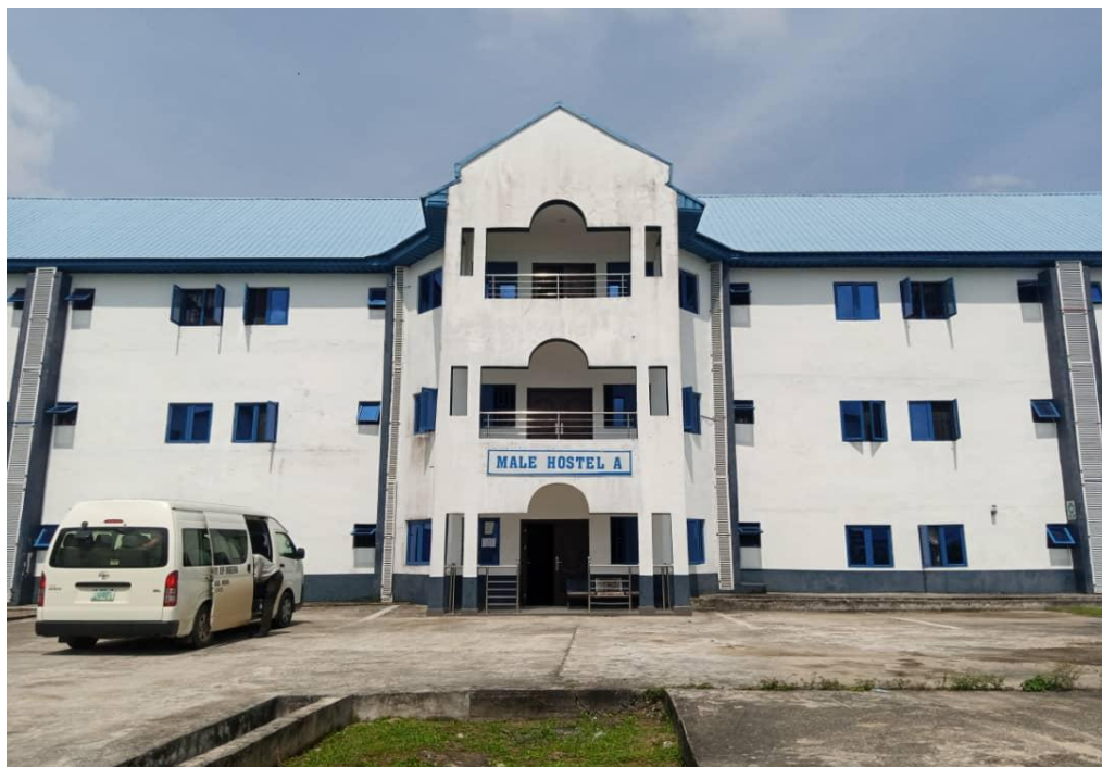
Fig. 64 Front view Picture showing Completed 200 Capacity Male Cadets Hostel of Maritime Academy of Nigeria, Oron, Akwa-Ibom State