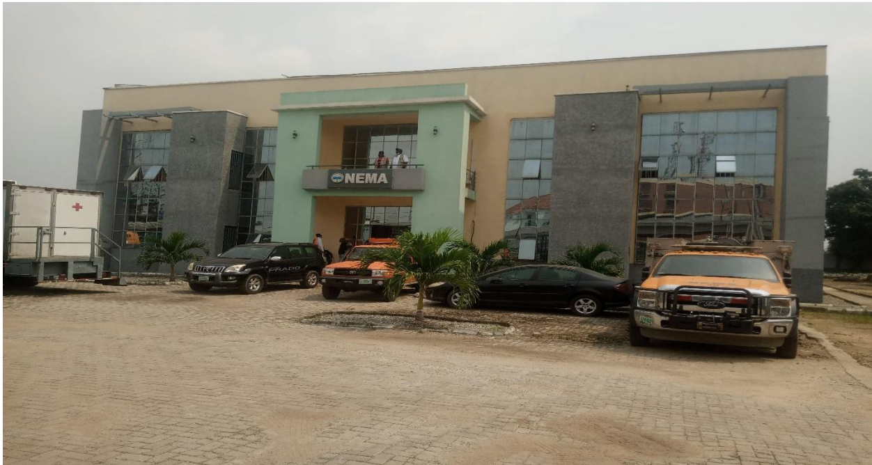
Fig. 71 Front View of the National Emergency Management Agency (NEMA) South West Zonal Office Lagos, Lagos State.