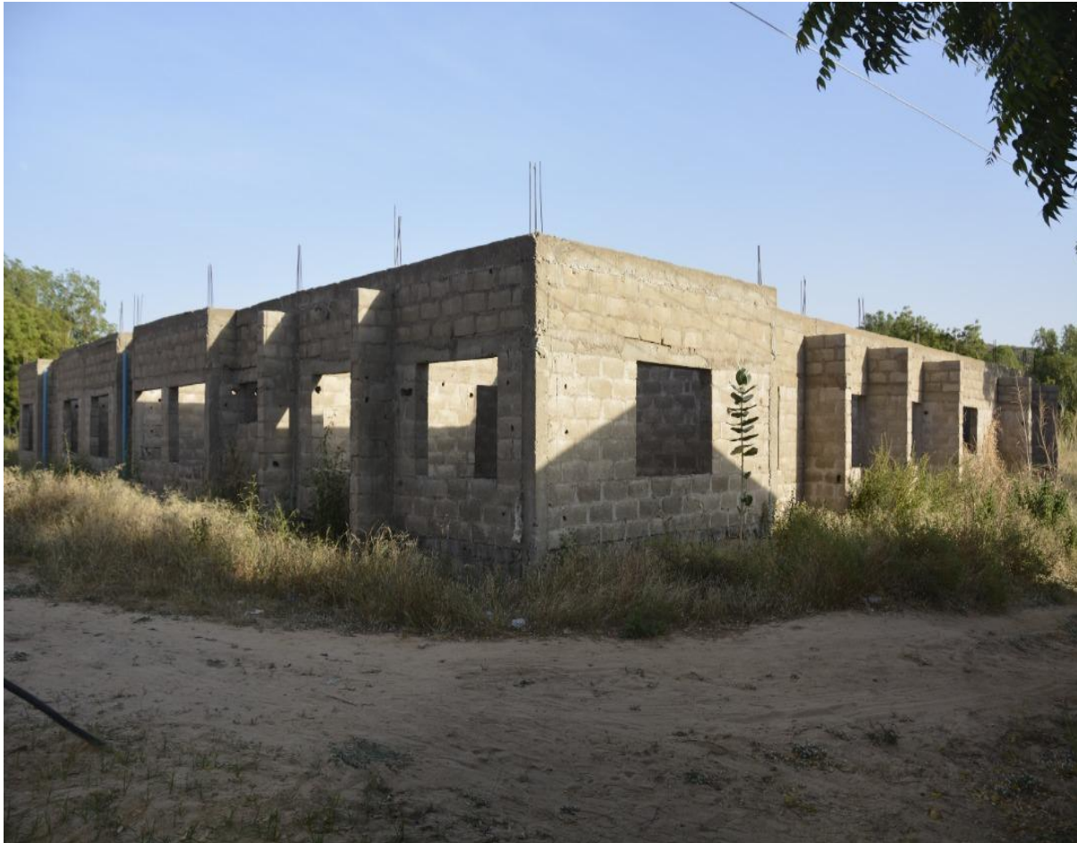
Fig. 29 On-going construction of Modular Theatres at FMC, Birnin Kudu, Jigawa State.

The contract was awarded on the 21st December, 2018 to JARWORTH Construction Services Limited at the sum of N200,697,455.89 for a duration of Thirty-Six (36) months. As at time of inspection, amount released and utilized for the project was N61,346,222.09. It had achieved 30% completion.