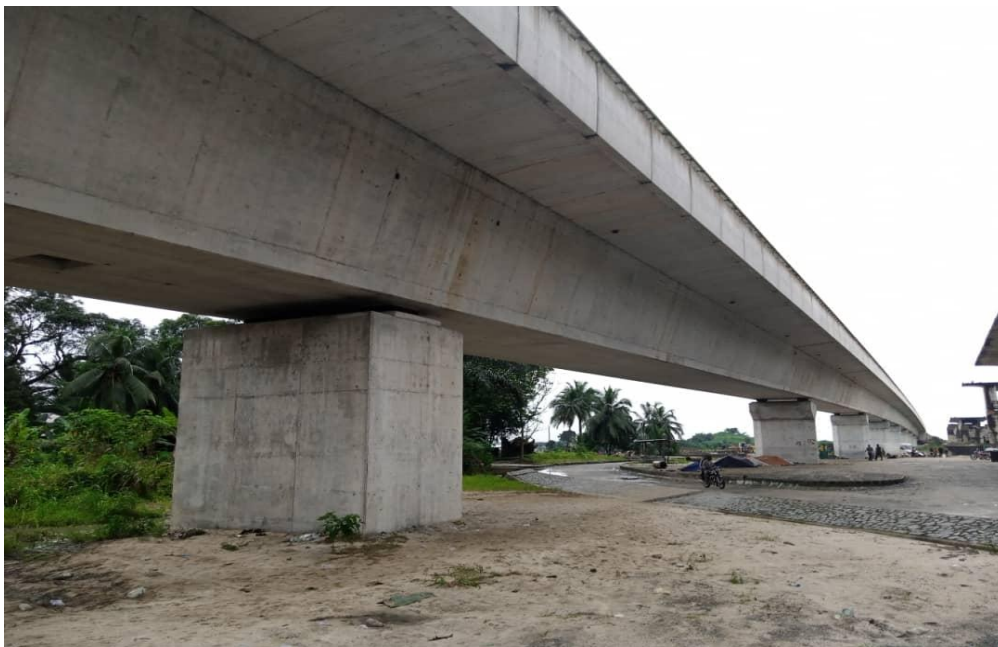
Fig. 57 Newly Constructed Afa Creek Bridge, Bodo-Bonny Road in Rivers-State