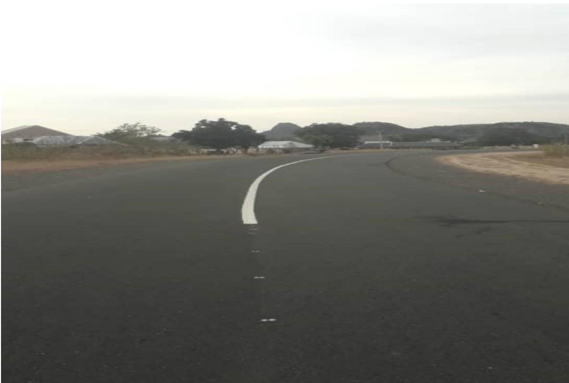
Fig. 17 Overview of the 2-lane single carriage road of the Construction of Burga-Dull-Mbat II-Tadnum Gobbiya Badagari-Gwarangah-sum, Bauchi State