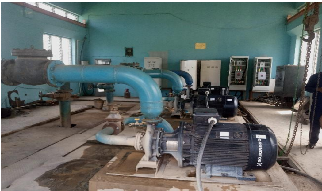
Fig. 72 Centrifugal Pressure Pumps at Obafemi Awolowo University Phase 1 and 2 water supplies