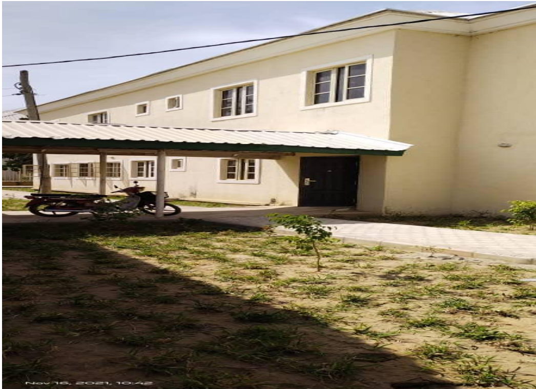
Fig. 19 Constructed Trauma Centre & the Recovery room (ATBUTH), Bauchi State

A. Construction of Trauma Centre Phase II: - The project is established and equipped to treat most high-risk injuries such as: - Gunshot wounds, major burns, traumatic car crash injuries, blunt trauma and brain injuries.