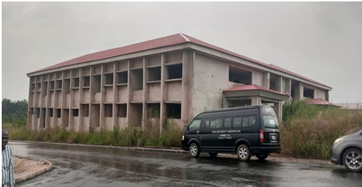
Fig. 47 Ongoing construction of Male Surgical Ward at the Nnamdi Azikiwe University Teaching Hospital, Nnewi, Anambra State