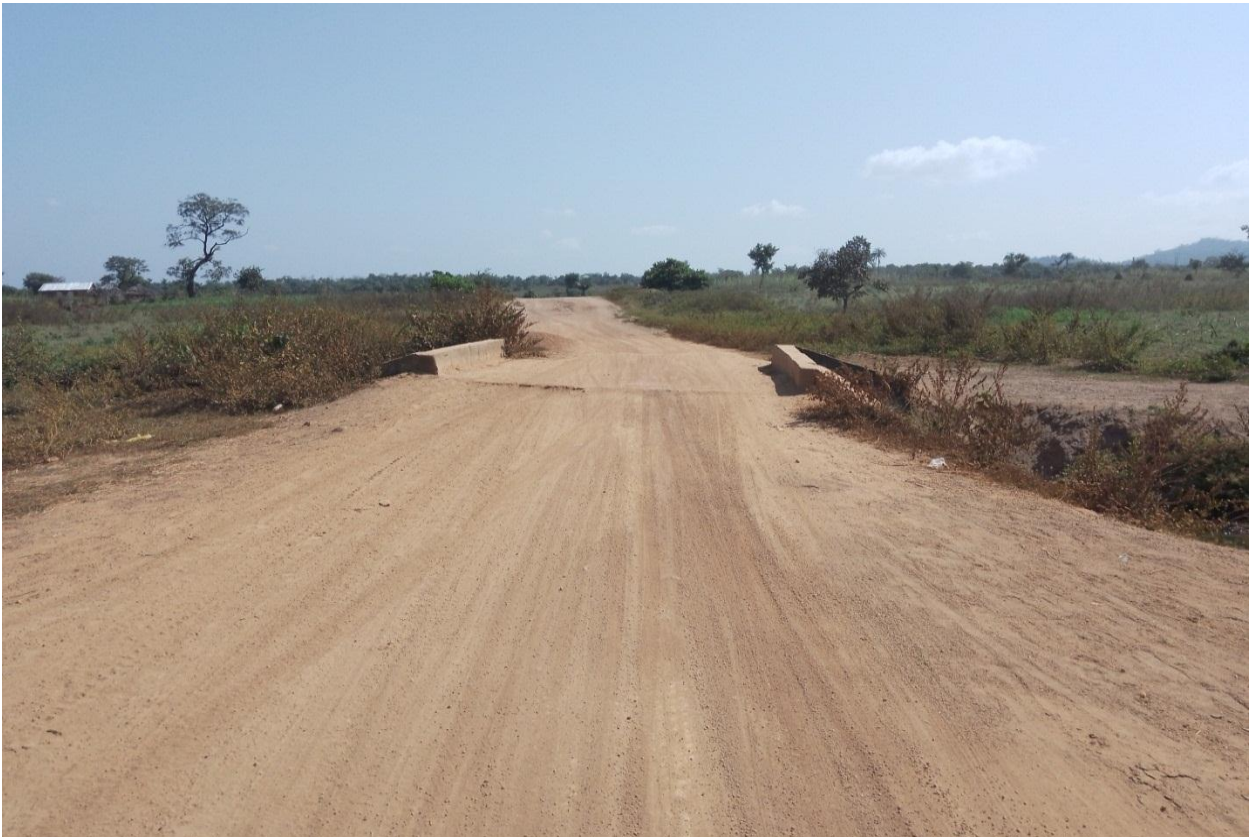
Fig. 6 Section of the 6.03KM Access Road in Agwada-Ugede- karu-Keffi- Kokona LGAs, Nasarawa state under construction

The Scope of the project involves site clearing of the entire length of the road, removal of vegetable top soil on the entire road, removal of unsuitable material at some sections of the road, filling and compaction to 100% BS compaction of margins, formation, slopes and amp across the section of the road, extension of two number culverts and construction of longitudinal line drains from chainage 0+000 to 0+730.