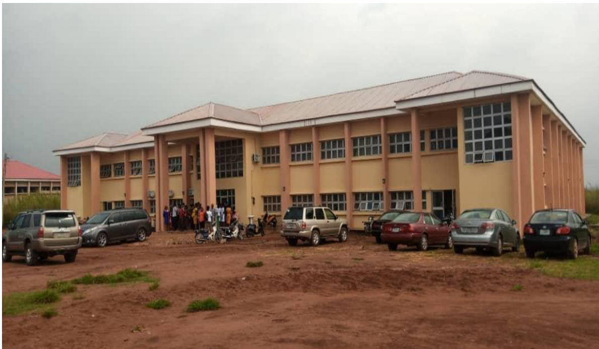
Fig. 45 A Cross-Section of the completed Specialty Clinic at the Nnamdi Azikiwe University Teaching Hospital, Nnewi, Anambra State

So far, total Amount Certified is N226,978,545.08 and total amount Paid is N226,978,545.08 leaving an outstanding amount of N16,576,427.20 (by FRC's calculation). Percentage Completion is 98.56%.