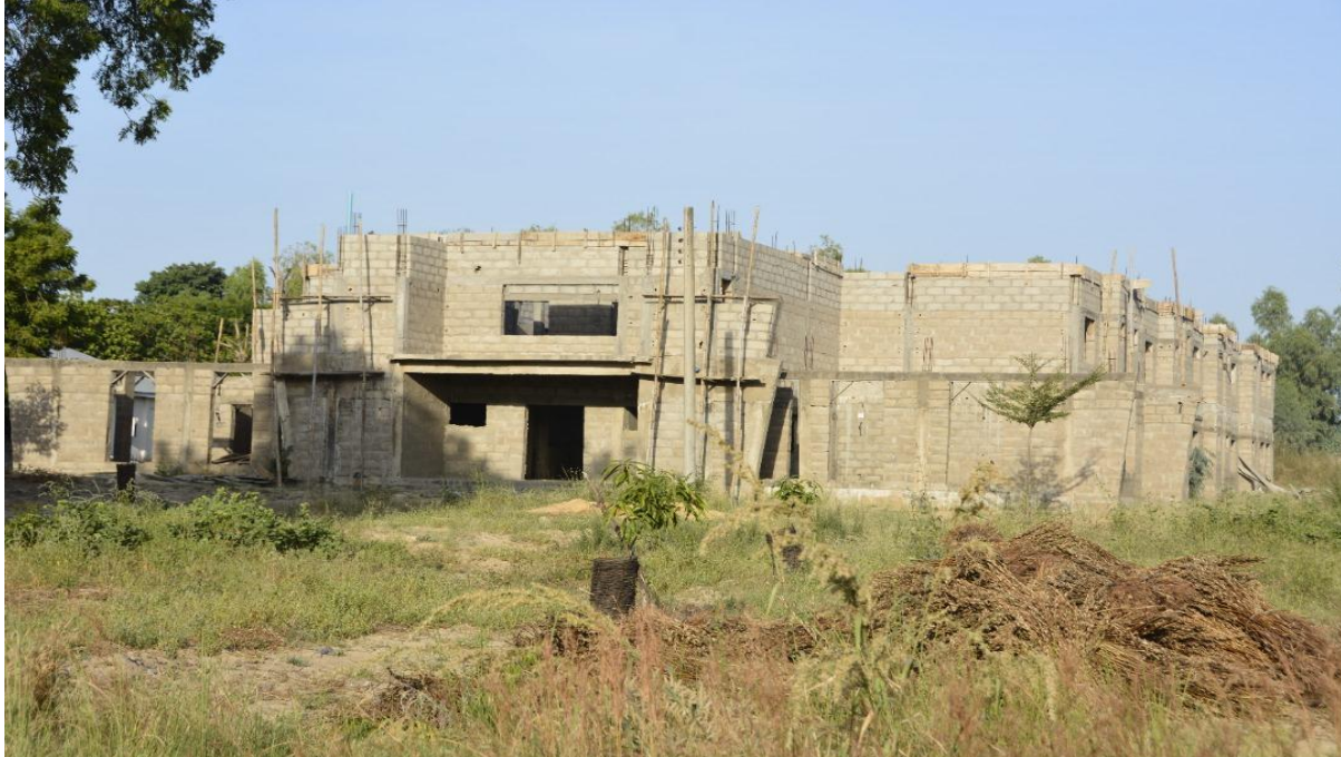
Fig.27 Ongoing construction of Hostel Block for School of Post Basic Mid-Wifery at FMC, Birnin Kudu, Jigawa State

The project aim is to institutionalize the Midwifery services and other flagship interventions to increase accommodation availability for students.