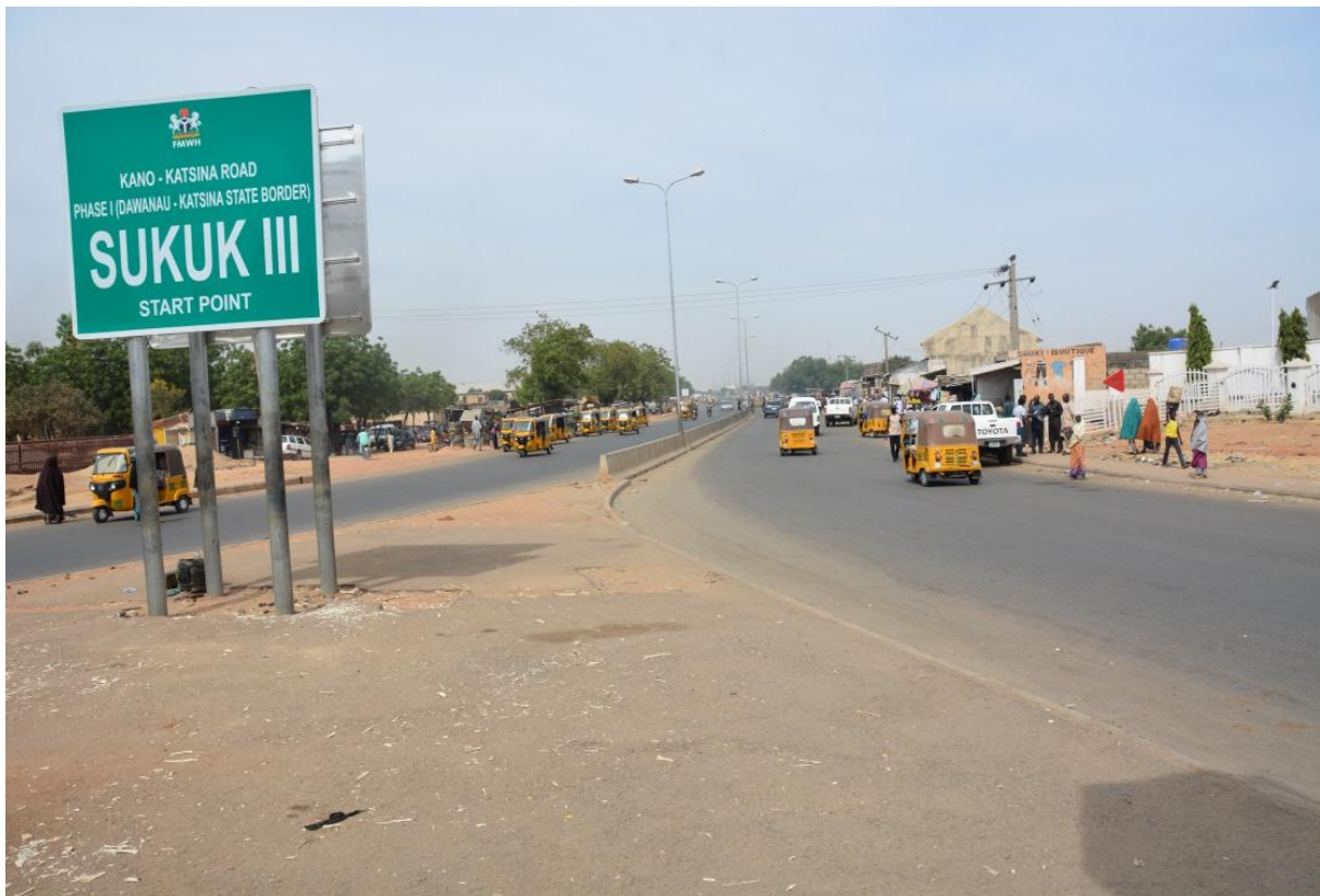
Fig.37 The ongoing Dualisation of Kano-Katsina Road Phase 1 (Kano town at Dawanau round about to Katsina border in Kano State)