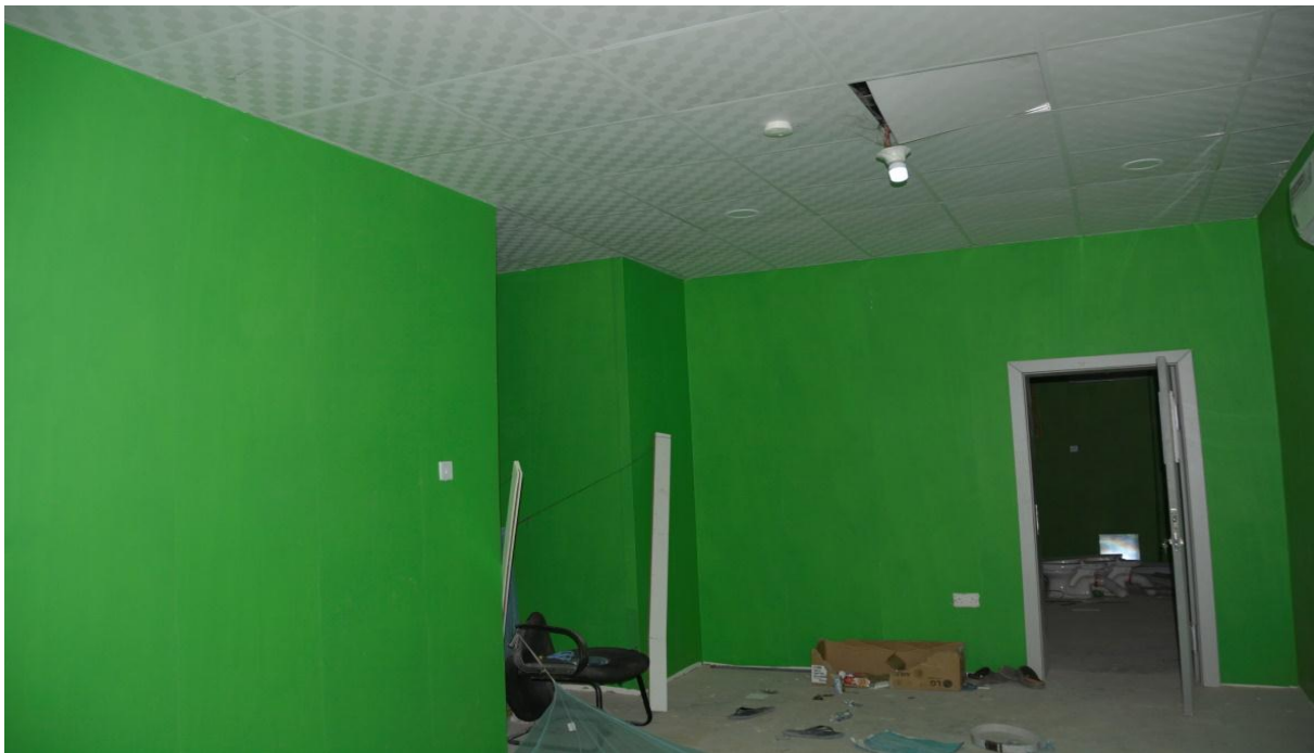
Fig. 32 The ongoing construction (Extension) of surgical Theatre at Aminu Kano Teaching Hospital, Kano

The contract was awarded on the 30th January, 2019 to Associated Rehabilitation Company Limited at the sum of N168,804,745.31 for a duration of Eight weeks. As at time of inspection, 94.30% completion has been achieved. Amount released from inception to date is N160,675,026.71 while N131,297,545.54 has been utilized on the project.