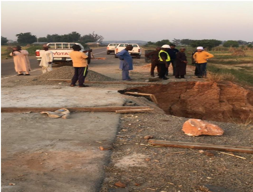
Fig. 14 Bad portion of the completed Tumu-Pindiga kashere (Gombe State)-Futuk Yola (Bauchi State) road

As at the time of inspection, the project was 100% completed but not yet handed over. However, a bad portion surfaced on the road after completion which the contractor promised to rectify.