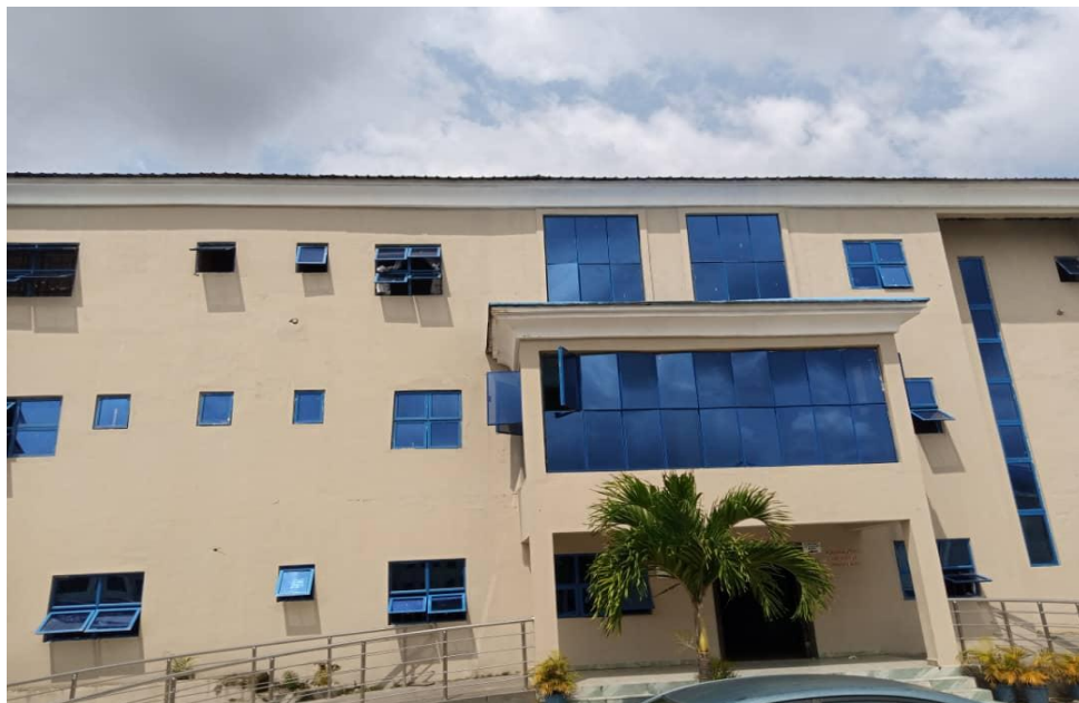
Fig. 58 Front view of the completed two Storey Surgical Ward at FMC Yenagoa, Bayelsa State

The project was awarded in December, 2010 to Brains Environment Nigeria Limited at the Contract sum of N224, 499,013. The following sums were released on the project for 2017, 2018 and 2019 respectively: N30,434,269, N47,058,085 and N62,332,000. Arriving at a total of N139,824,354.