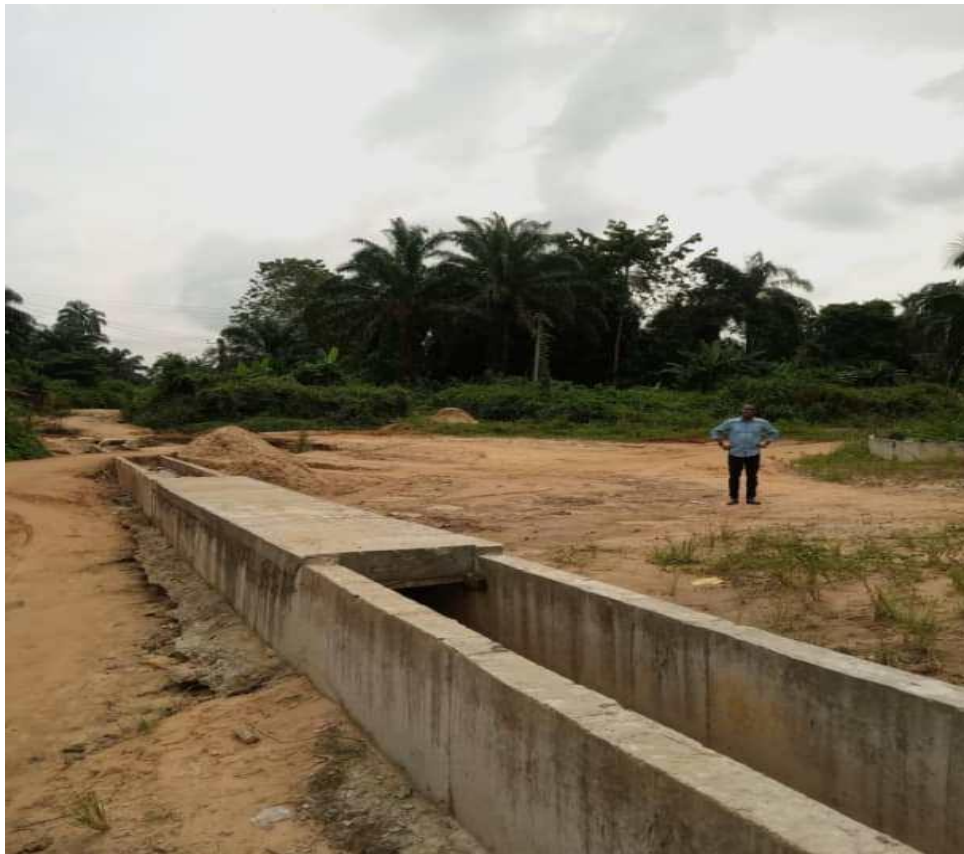
Fig. 65 1400m Reinforced concrete drainage for both sides on going Nto- Ekpe-Atan Ibong road, Obot-Akara LGA, Akwa-Ibom North-West Senatorial District, Akwa-Ibom State

However, on the day of the inspection, the contractor failed to turn up and all efforts to contact him were fruitless, as his telephone number was not reachable.