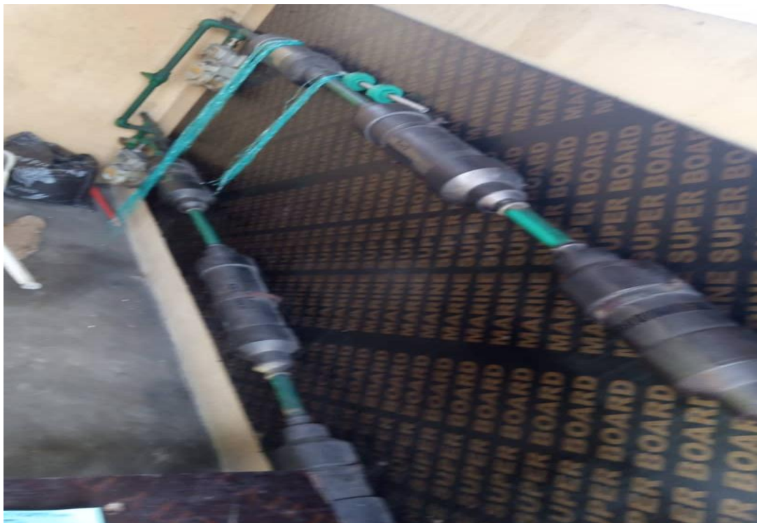
Fig. 55 The bio-gas drain pipes and fittings at the Port-Harcourt Maximum Custodial Centre, Rivers State.