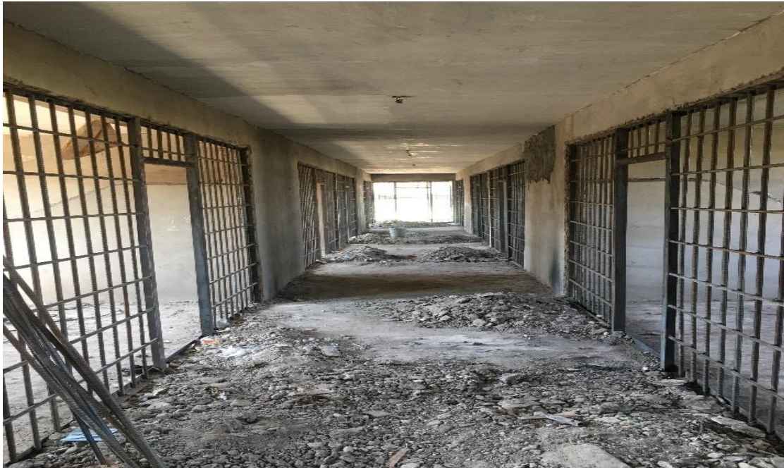
Fig.25 View of the ongoing construction of cell blocks at the NCS custodial Centre, Yola

The Contract was awarded to Iskat design Limited at the contract sum of ₦209,365,462.20 on 23rd December, 2019. Total amount paid to date is ₦134,393,454.21.