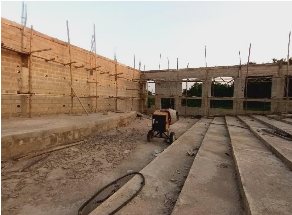
Fig. 69 On-going Construction of 1000 Capacity Lecture Theatre at FCA, Ibadan, Oyo State.