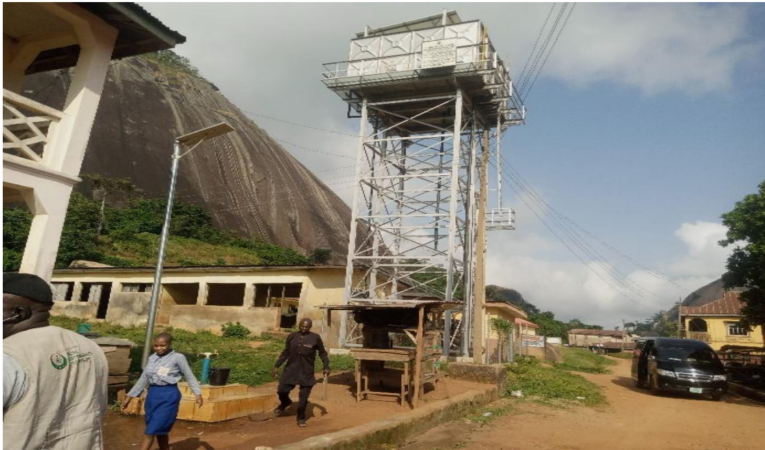
Fig. 70 One of the fetching points and 50 cubic meters Overhead Water Tank at Idanre, Ondo State.