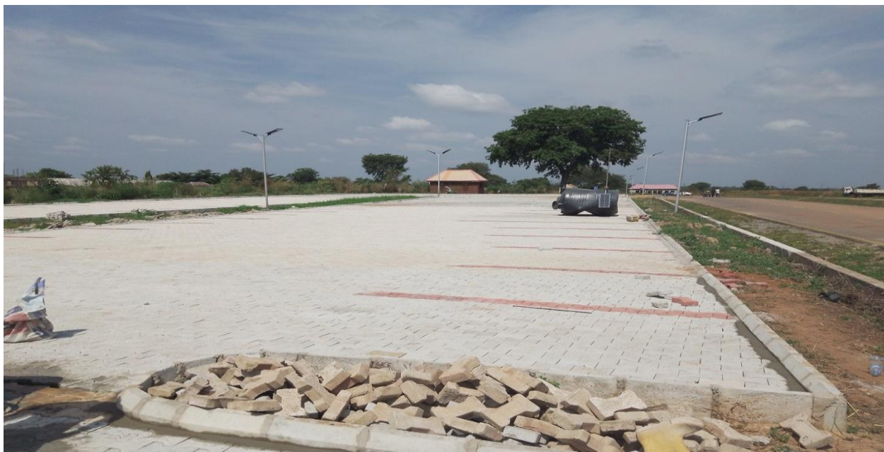
Fig. 12 The new Parking Lot at the Federal Medical Centre Apir, Markudi