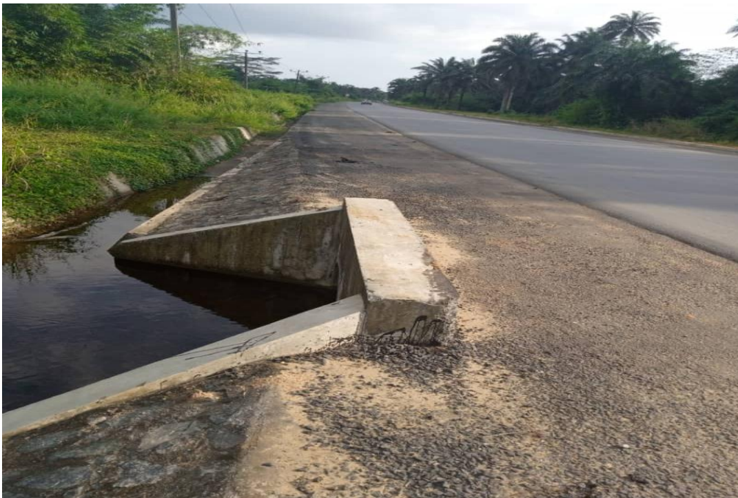
Fig.54 One of the completed Box Culvert on the Abak-Ekparakwa-Ette-Ikot-Abasi Road in Akwa-Ibom State