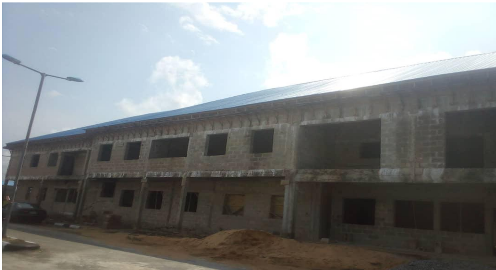
Fig. 60 View of the theatre building showing roofing already completed at FMC Yenagoa, Bayelsa State