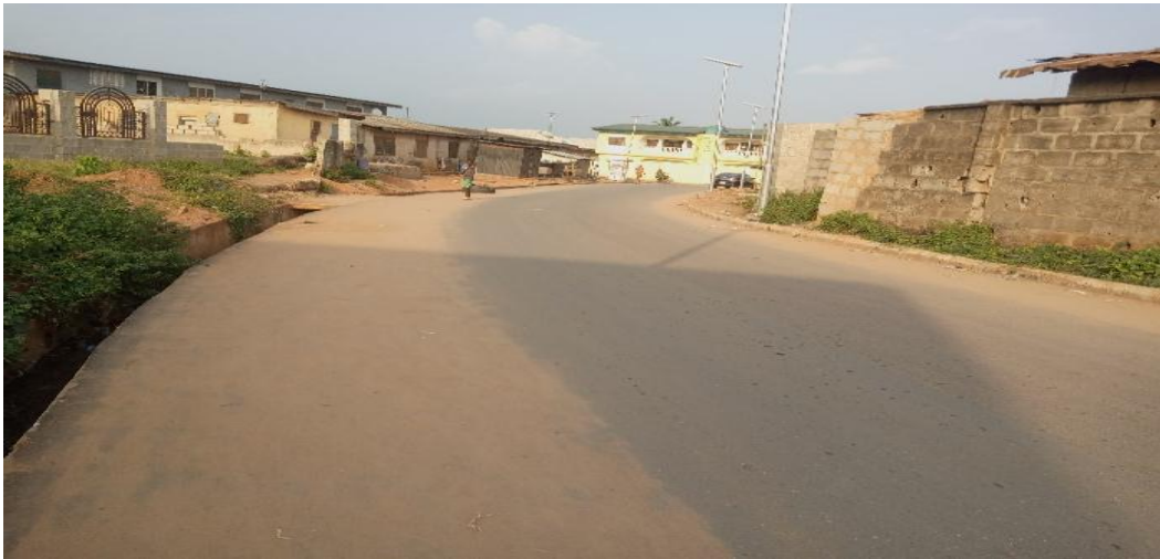
Fig. 74 Asphalted section of Nike Olubodun Street in Ikorodu Federal Constituency, Lagos

The scope of the project is made up of surveying work, drainage work, earth work, sub-base material – provision, laying and compaction of laterite materials, base course material – provision, laying and compaction of stone base materials, provision and spraying of prime coat material (bitumen emulsion), provision, laying and compaction of wearing course.