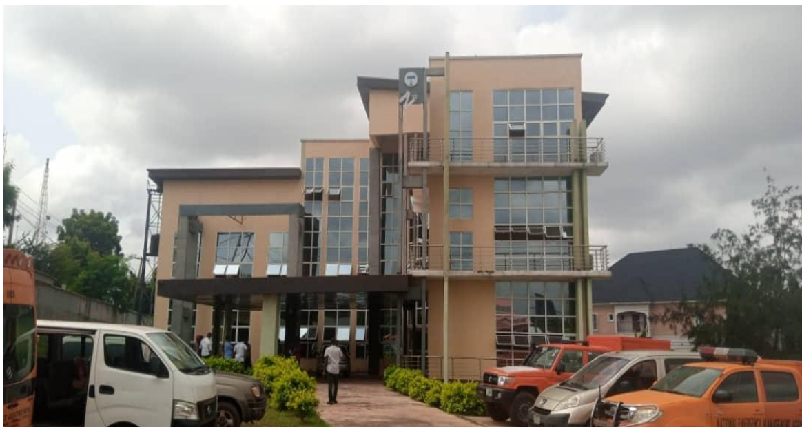
Fig. 41 Front View of the NEMA South-East Zonal Office in Enugu State

Total Payment made to date is N292,573,920.74 while balance of payment due to the Contractor is N32,468,312.40.