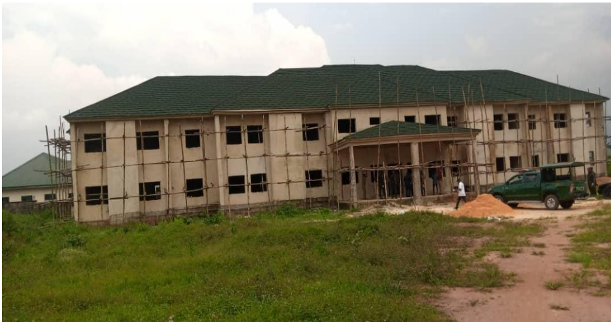
Fig. 51 Ongoing construction of SHQ office of NCS at Umuahia, Abia State