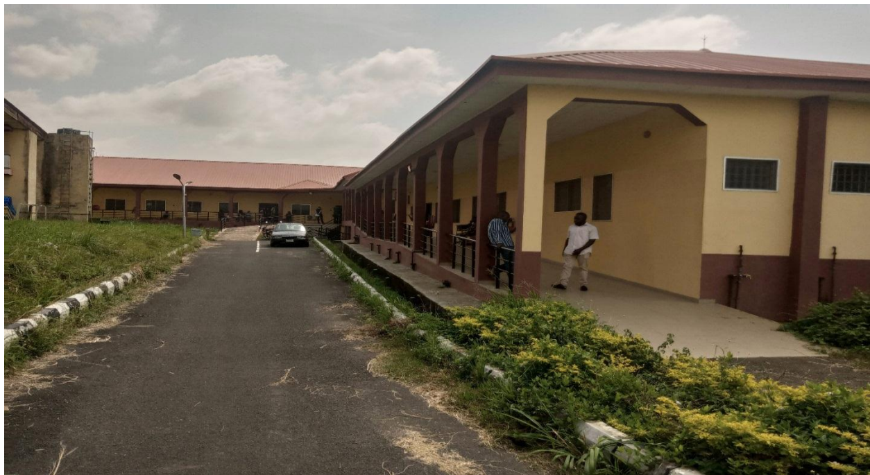
Fig. 77 Front View of Completed Male and Female Surgical ward at WGH, Ilesha, Osun State

The building is a low rise building with an incorporated basement due to the construction location site topography. The building consists of a male ward, a female ward, clinics, consulting rooms, offices, a private ward, side lab, pharmacy, a record office, a cash point, a catheter dressing room, bathrooms and rest rooms.