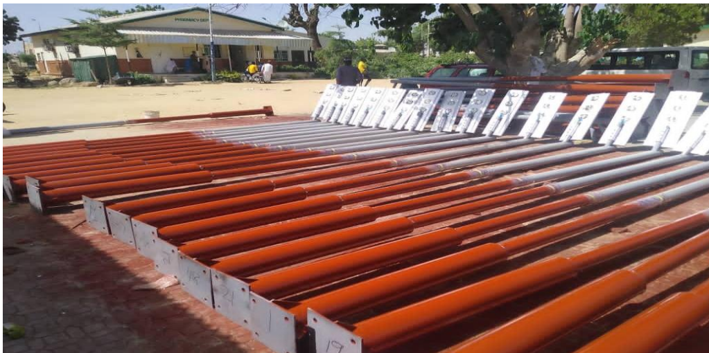
Fig. 31 Solar poles for street light at FMC, Birnin Kudu, Jigawa State