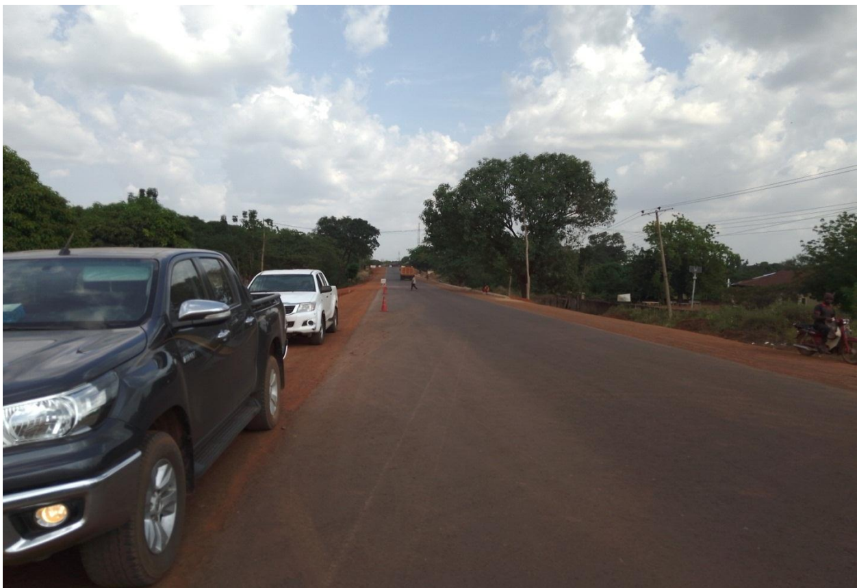
Fig. 9 22km length of Asphalted Road of Makurdi-Naka-Adoka Road, phase 1