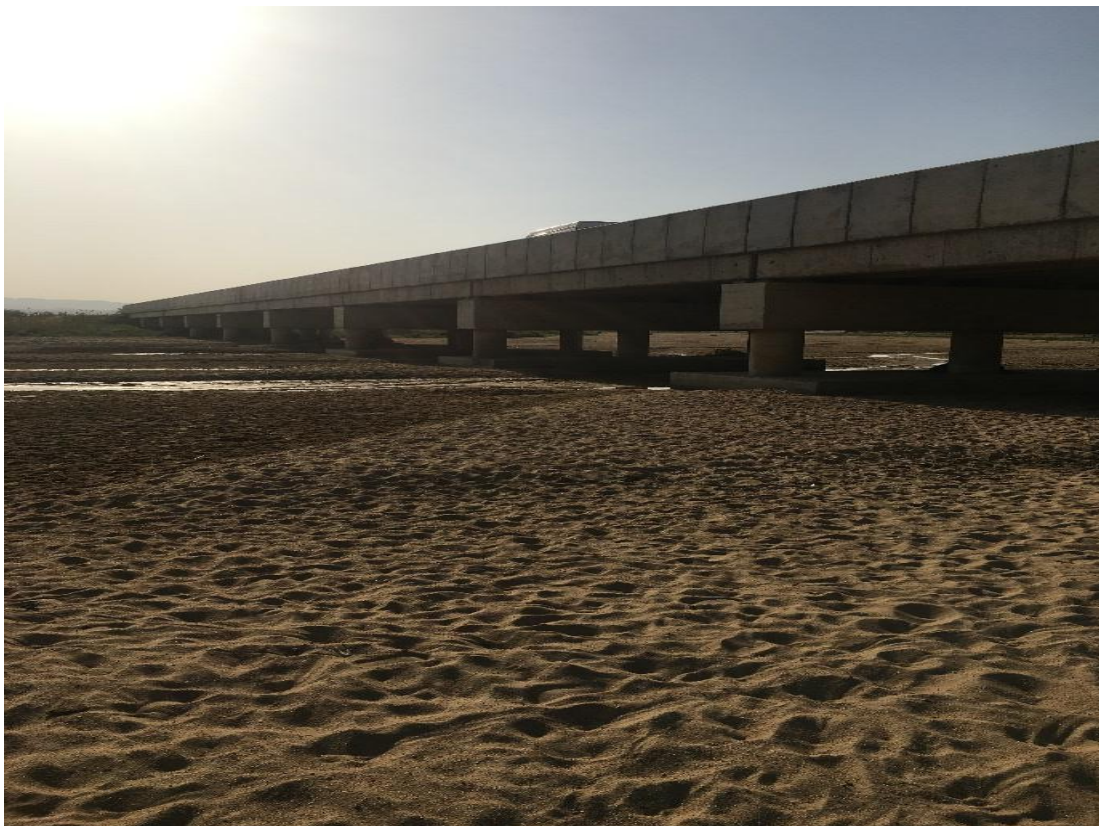
Fig. 18 View of a Constructed bridge in Tudun Wuss-Wandi-Baraza-Durr-Zumbul-Polchi-Dot-Kwanar, Bauchi State

Government should ensure funding of the project in other to prevent project abandonment.