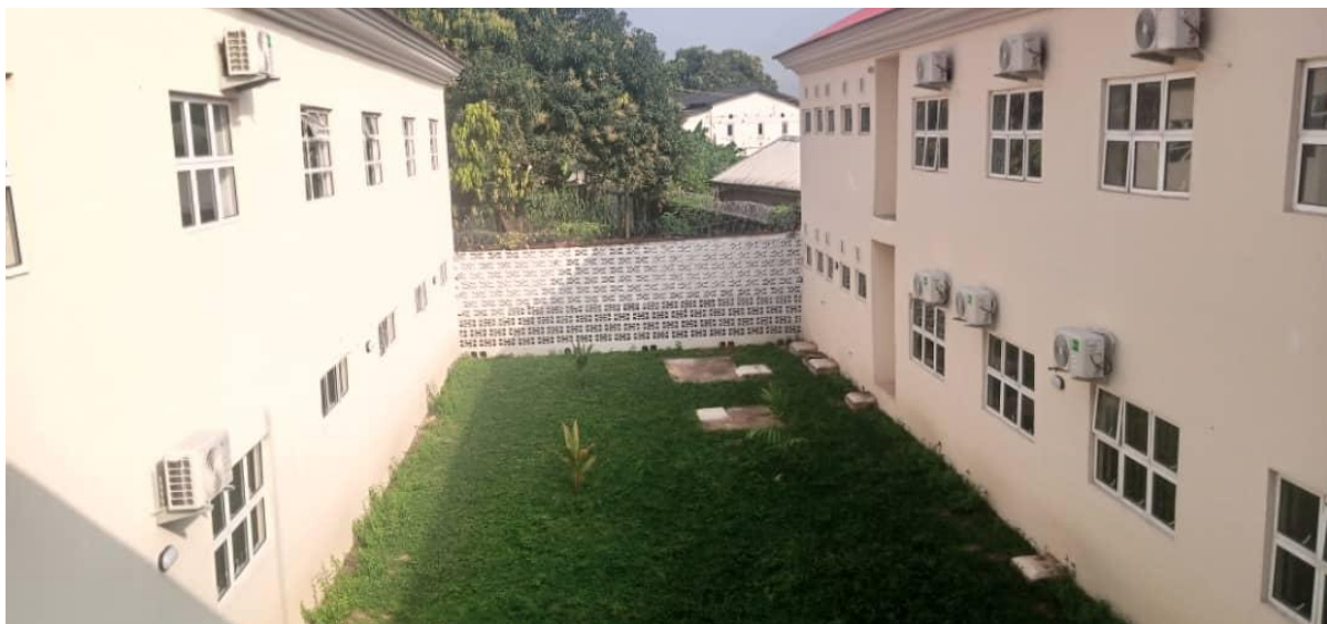
Fig. 52 The Internal Landscaping work at the ITF Area Office, Owerri, Imo State

Three (3) nos. certificates have so far been raised. Advance payment of N37,453,850.52 was made to the contractor on 17 th March, 2020. Two valuation certificates valued at N49,266,847.52 and N98,343,718.73 were paid on 17 th March, 2021 and 27 th October 2021 respectively. Percentage completion is 90%,