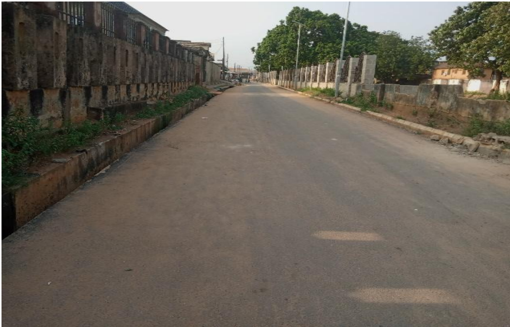
Fig. 75 Asphalted section of Alhaji Ajoke Oduyebo Street in Ikorodu Federal Constituency, Lagos State

The scope of the works includes but not limited to the following: surveying work, drainage work, earth work, sub-base material – provision, laying and compaction of laterite materials, base course material – provision, laying and compaction of stone base materials, provision and spraying of prime coat material (bitumen emulsion), provision, laying and compaction of wearing course.