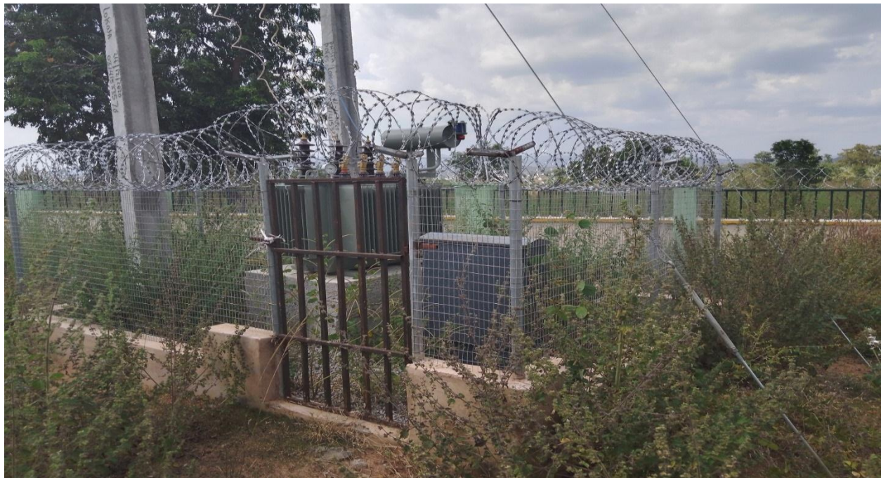
Fig. 3 A newly Purchase Transformer at the Headquarters of Nigerian Correctional Centre Lokoja

The Scope of the project includes; construction of Borehole; Overhead Tank and Water Reticulation, Installation of Transformer, Connection to National Grid and Electricity Reticulation; Construction of boundary Fence; Construction of Quarter guard; supply and installation of Generator for the borehole.