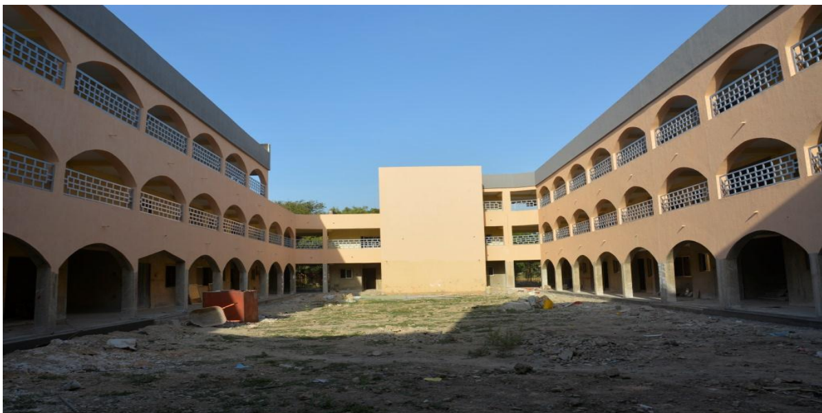
Fig. 34 Inside view ongoing construction of 40 flats for Residents Doctors at AKTH, Kano

The project was initially awarded to Standard Construction Nigeria Ltd. in 2001 which was abandoned. In 2009, the contract was reactivated/re-awarded to the same contractor at the contract sum of N401,652,880.01 with a duration of eight weeks. As at time of inspection, 52.40% completion had been achieved while amount released and utilized is N179,667,546.45.