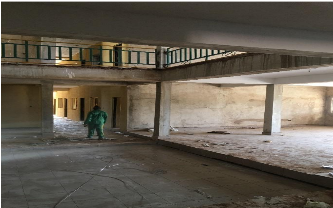
Fig. 23 Inner view of the Construction of the State Headquarters (NCS) Office Complex Gombe State

The Contract was awarded to Umar Bahago Water Engineering Service Ltd at the contract sum of ₦148,615,530.31 on 23rd December, 2019 to be completed in December, 2021