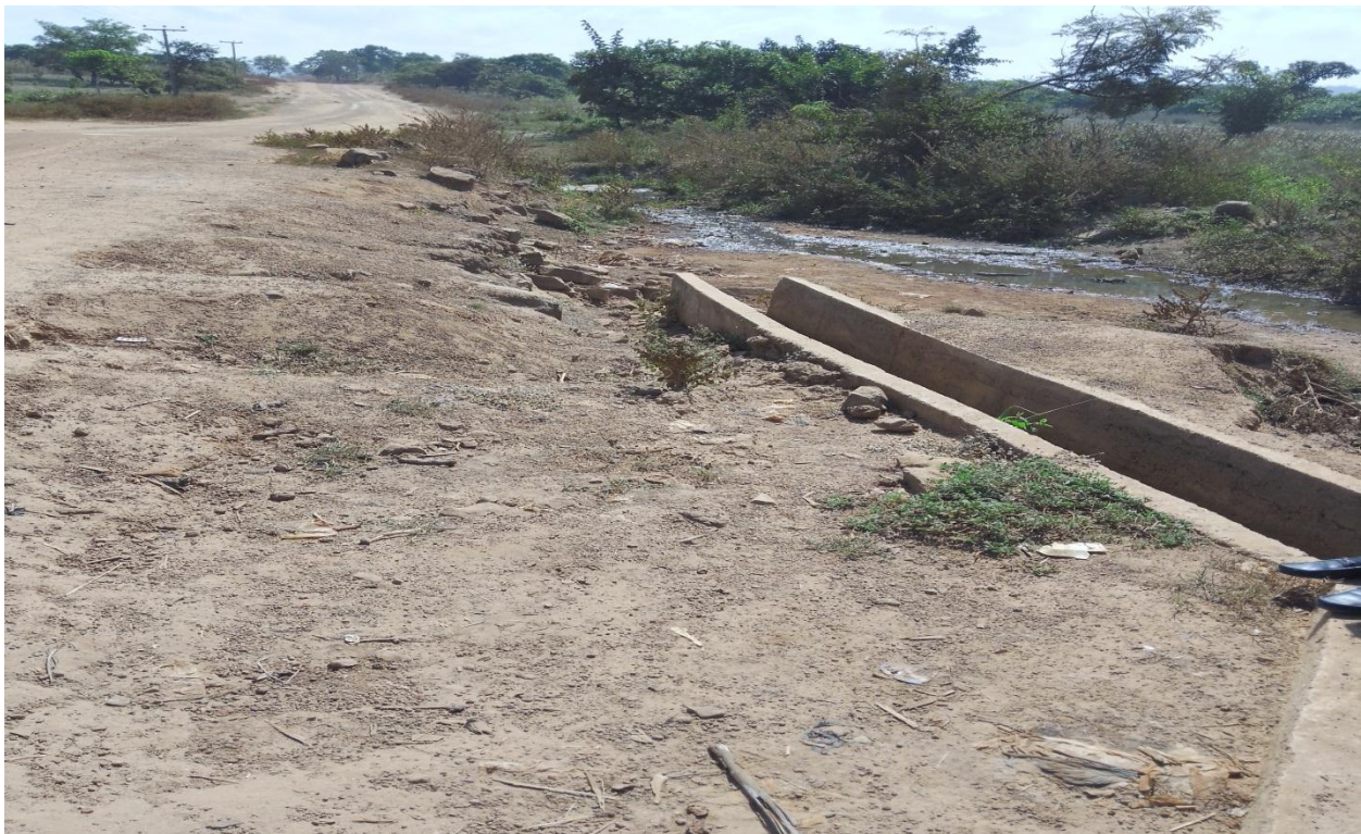
Fig. 7 A section of the constructed longitudinal line drains at Agwada-Ugede in Nasarawa State