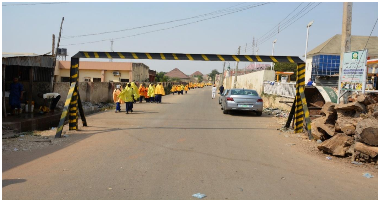
Fig. 37 The completed construction of 2 km asphalt road and 3 in 1 solar street light at Gwale, tudun yola, Emirate Street, Kano state