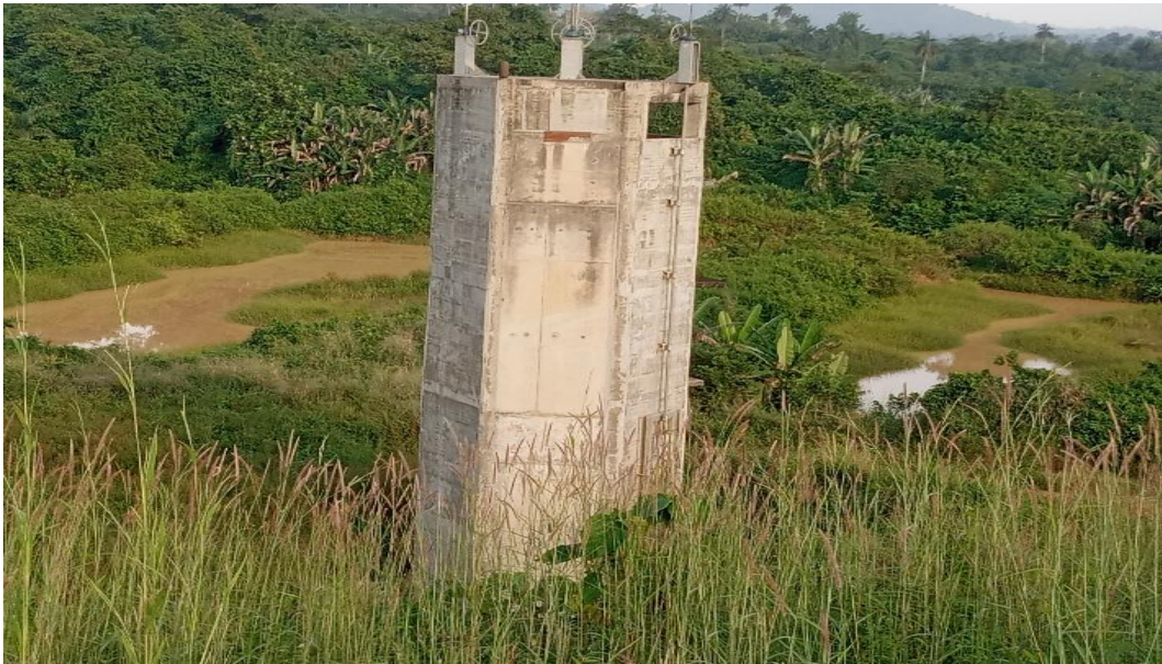
Fig. 73 Intake Tower at Ile – Ife Multipurpose Dam