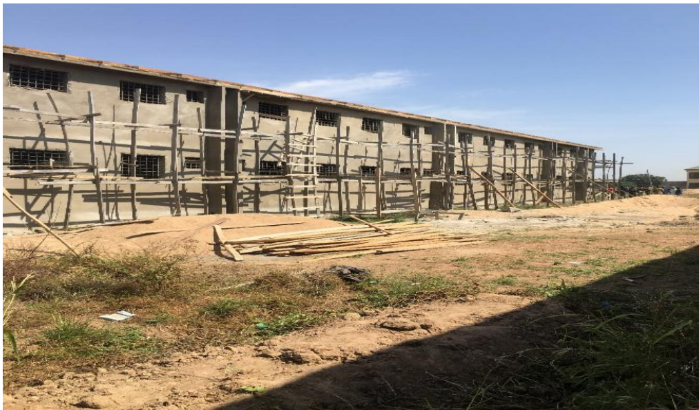
Fig. 24 View of the Construction of concrete storey building cell block, (NCS) custodial center, Yola, Adamawa State.