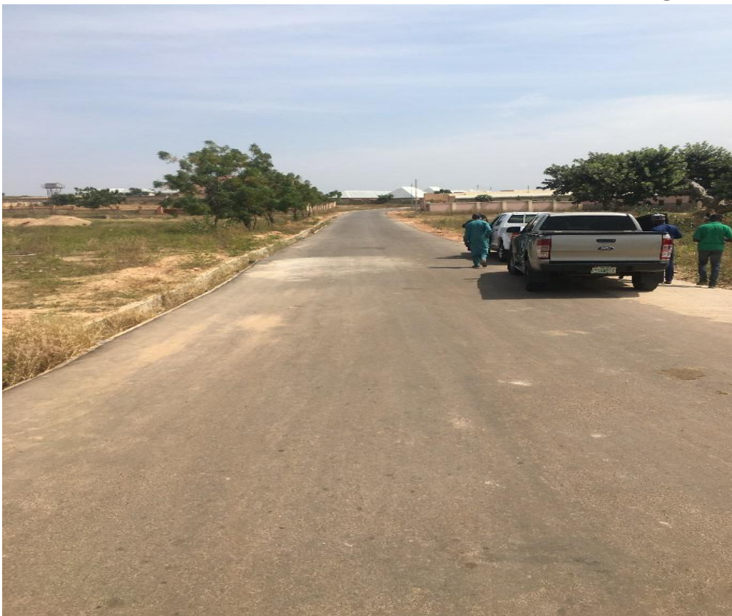
Fig. 15 Already Constructed section of the Jauro rose, Kashere, Akko Local Government Road in Gombe State

The project scope involves construction of 1.5km road length, 6m road width, 8nos of culverts, and construction of drains, Pavement and surfacing.