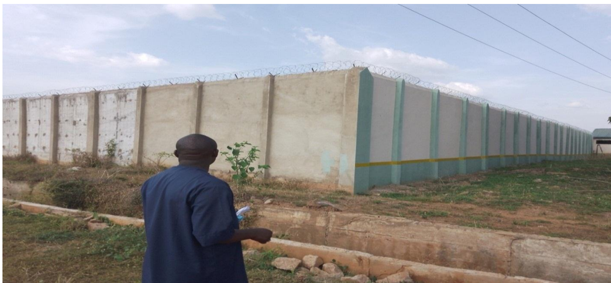
Fig. 4 Completed Concrete Perimeter Fence at Koton-Karfe Custodial Centre, Kogi State

A. The Construction of Solid Concrete Standard Perimeter Fence at Koton Karfe Custodial Centre Kogi State, awarded on the 24 th December, 2019 to Dapprime Tech and Resources Limited at a contract sum of N175,965,983.73