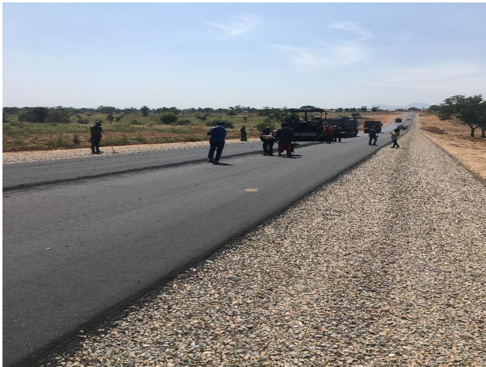
Fig. 26 Ongoing Rehabilitation work at the Ngurore-Ganye road Adamawa state

Amount certified to date is ₦7,128,527,173.23.